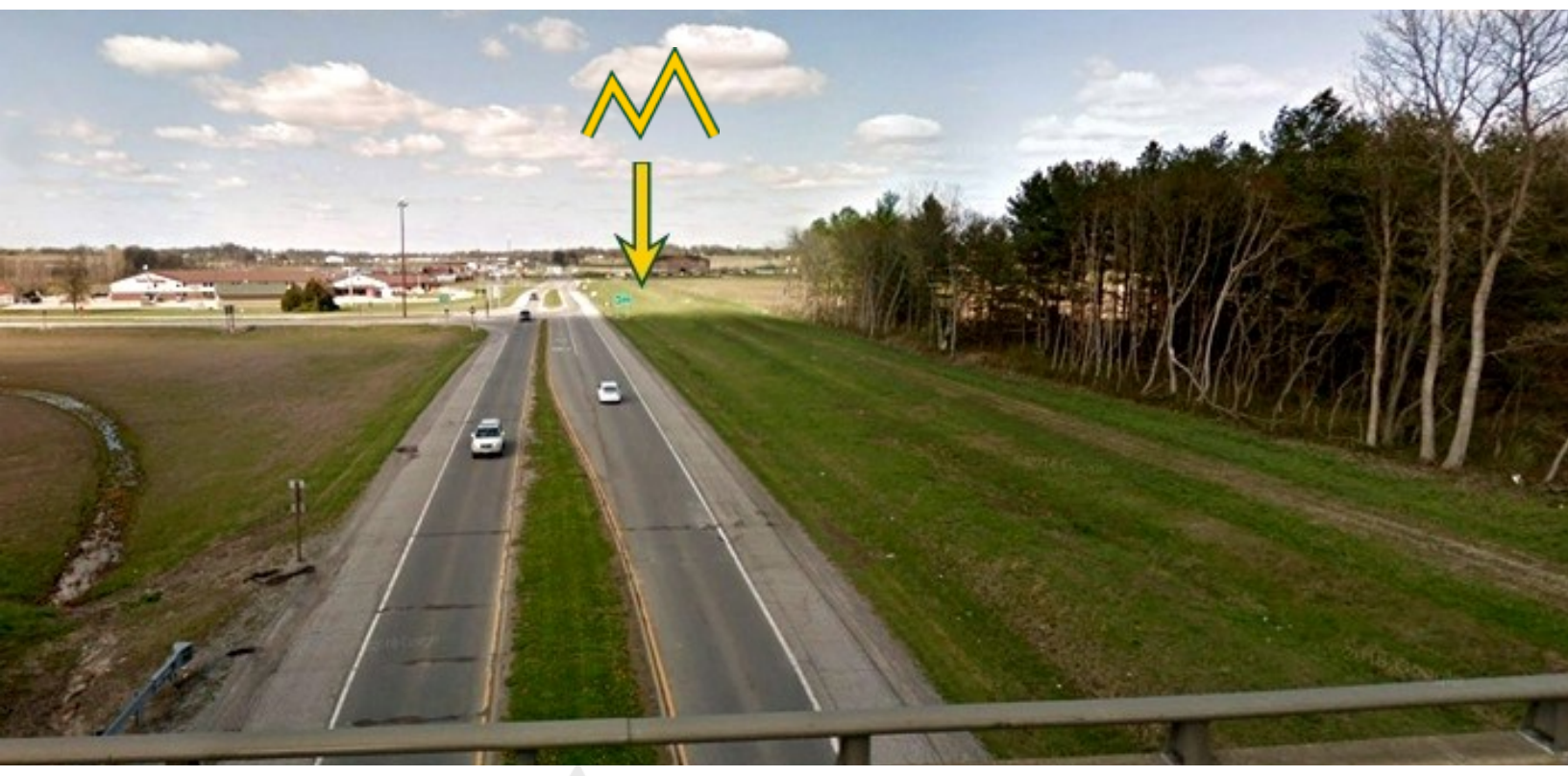
View of site looking north from I-64 overpass.