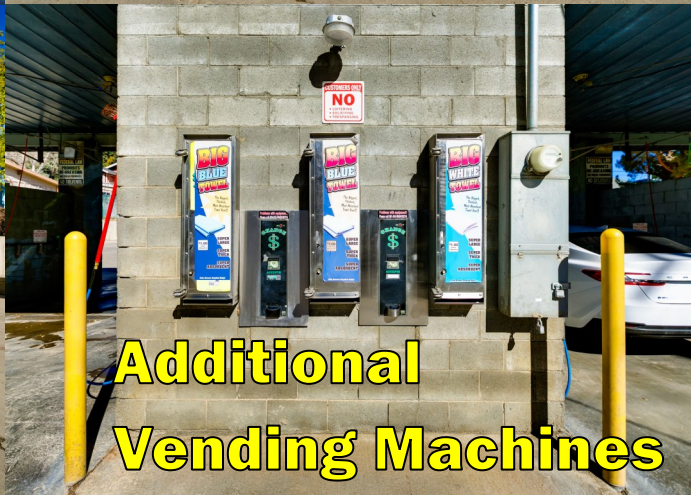
Additional Vending Machines