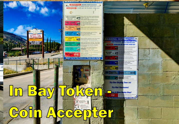
In Bay Token - Coin Acceptor