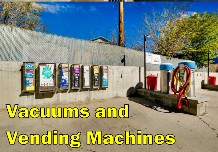
Vacuums and Vending Machines