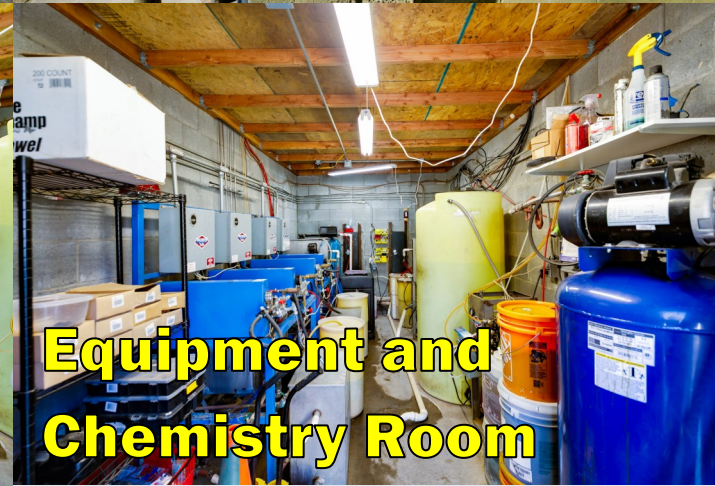
Equipment and Chemistry Room