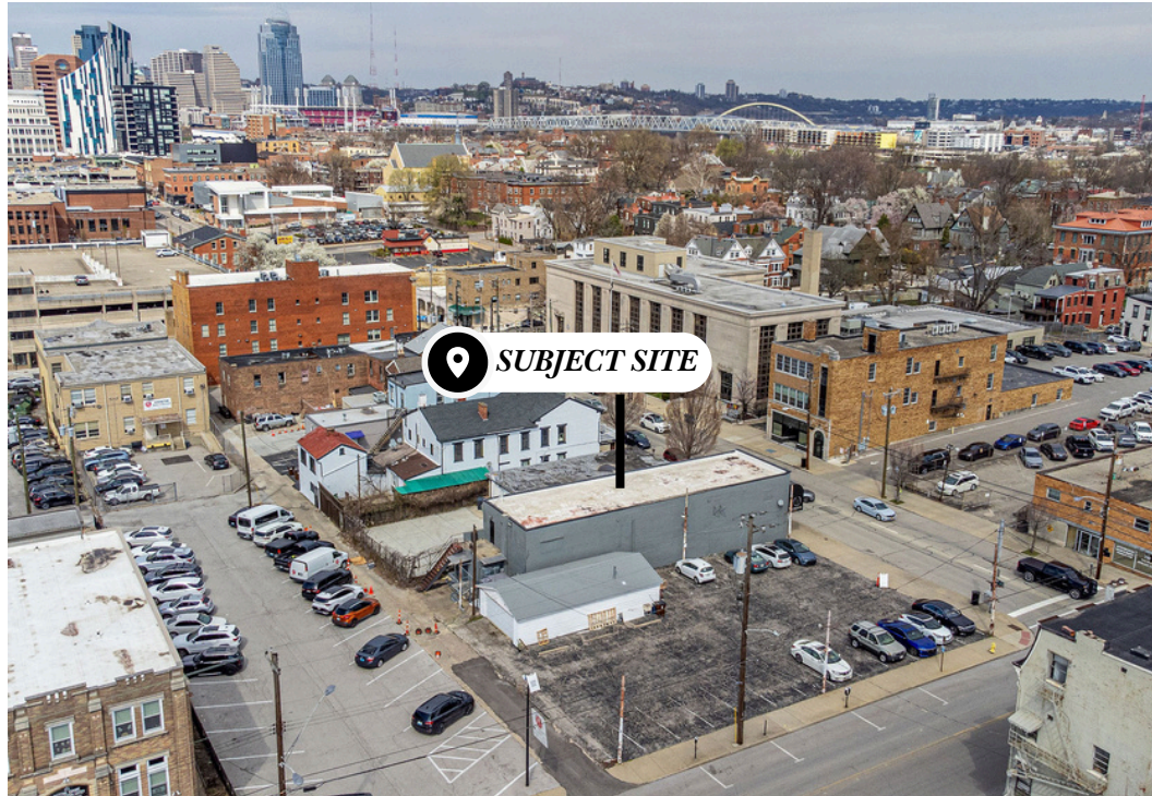
729 SCOTT STREET