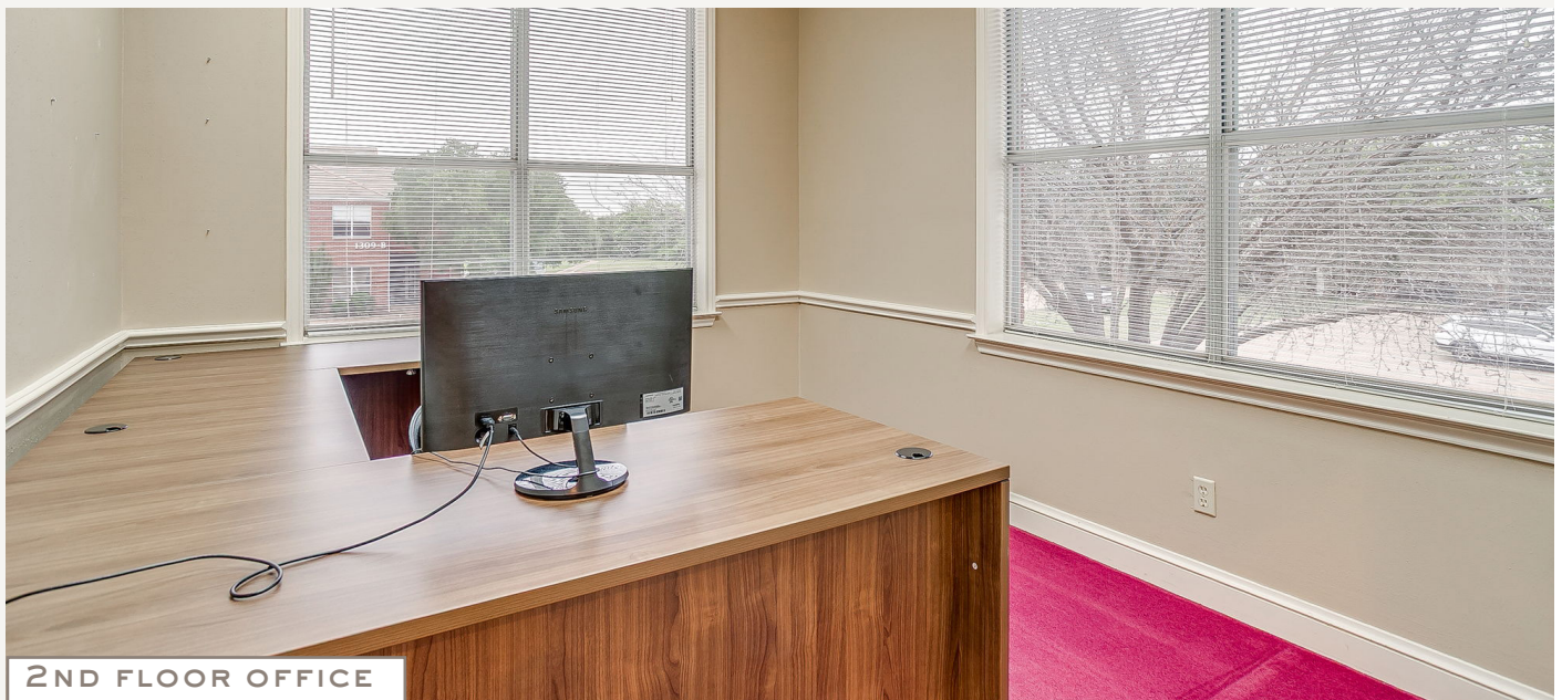
2ND FLOOR OFFICE