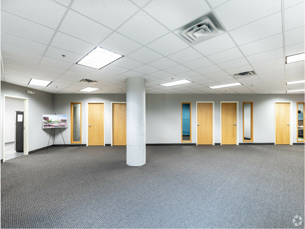
Suite 181 up 5,800 sq ft available