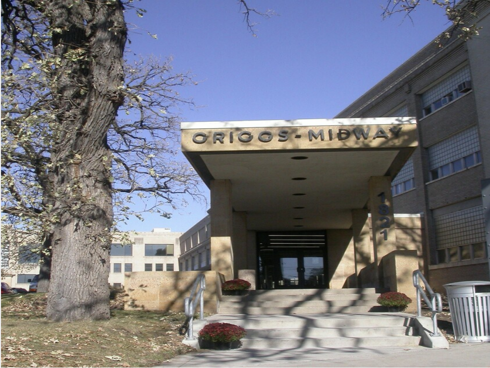
1821 University Ave