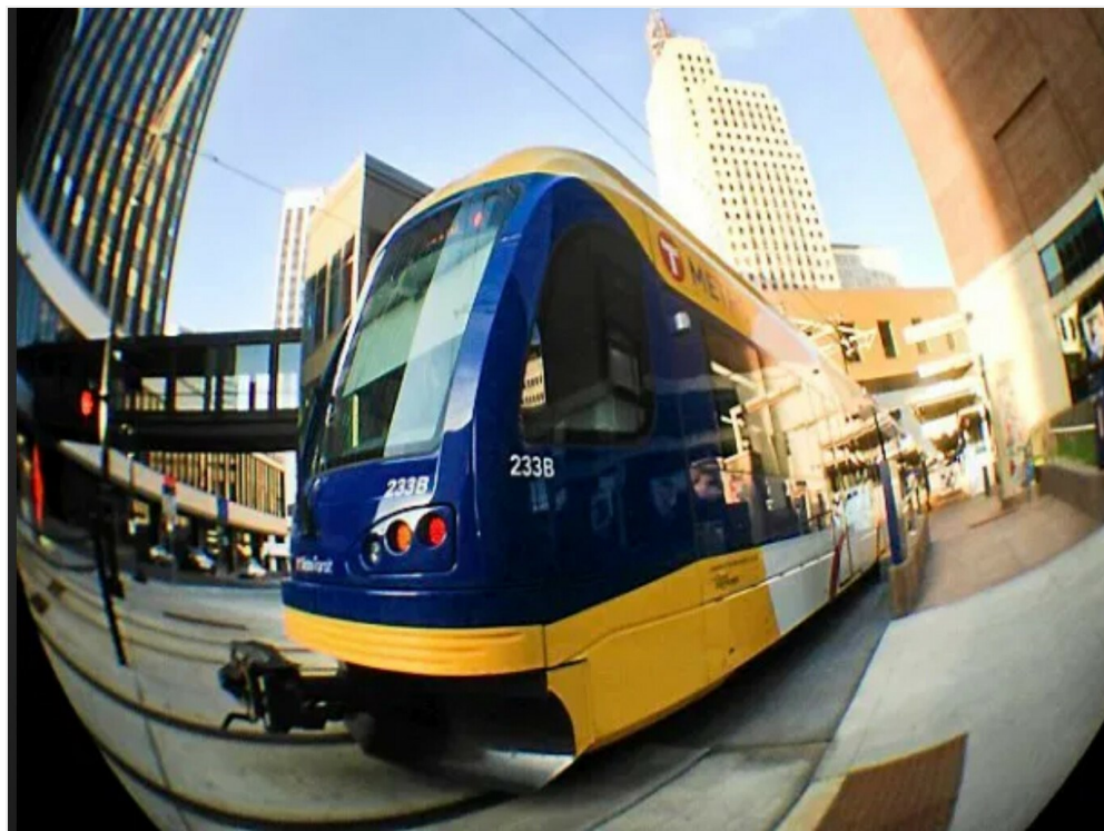
Proximity to Light Rail