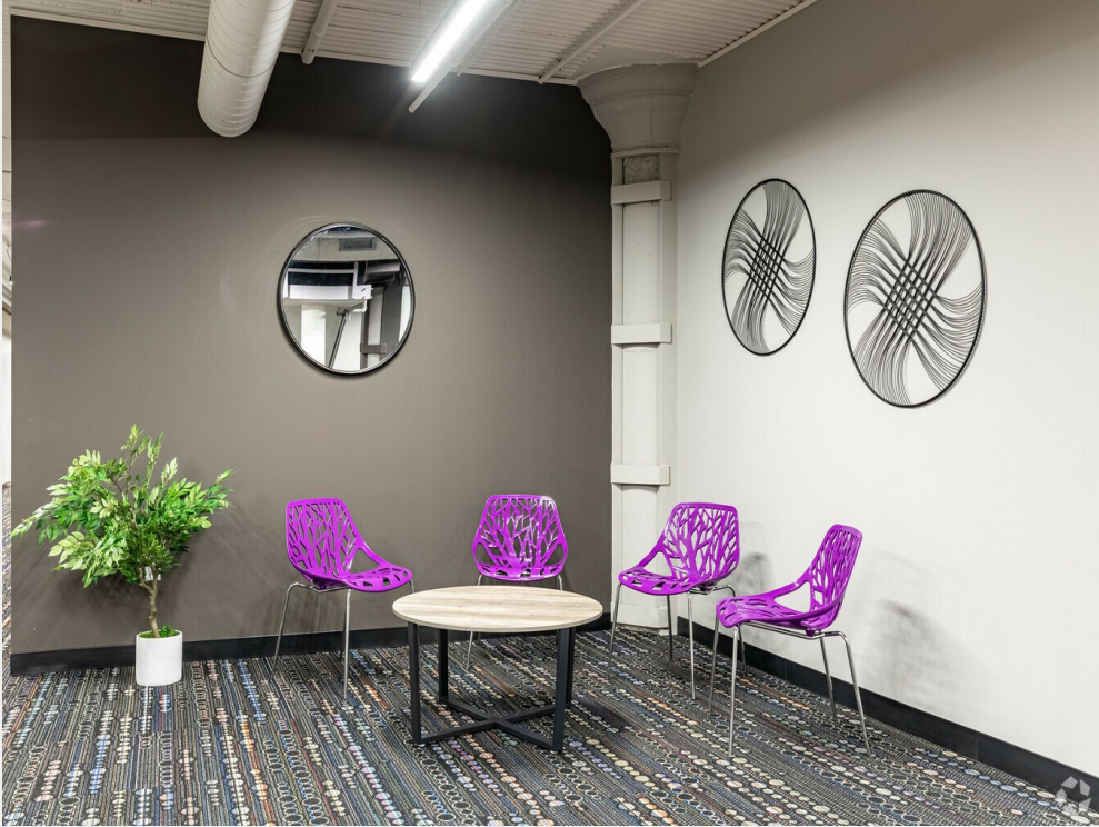
Co-Working Space Common Area