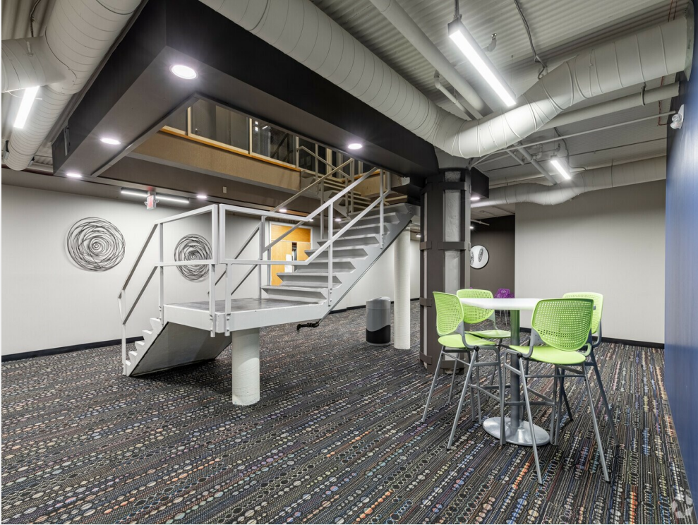
Small Business Center