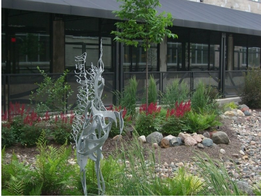
Enjoy a walk in our courtyard