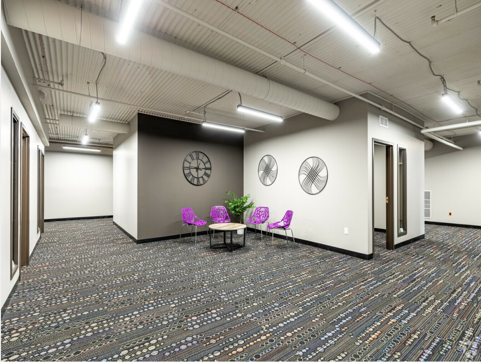
Small Business Center