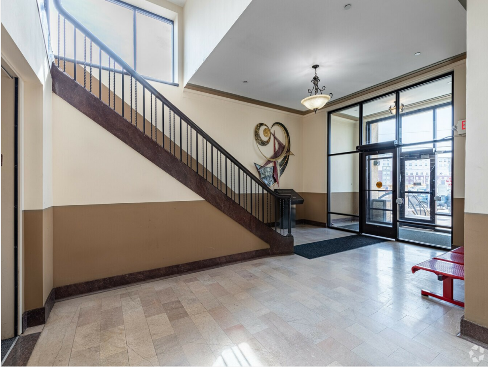
Lobby 540 Fairview