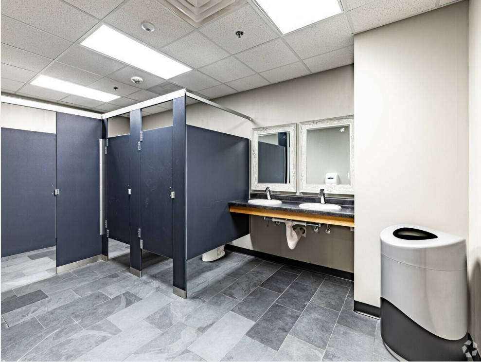
Small Business Center