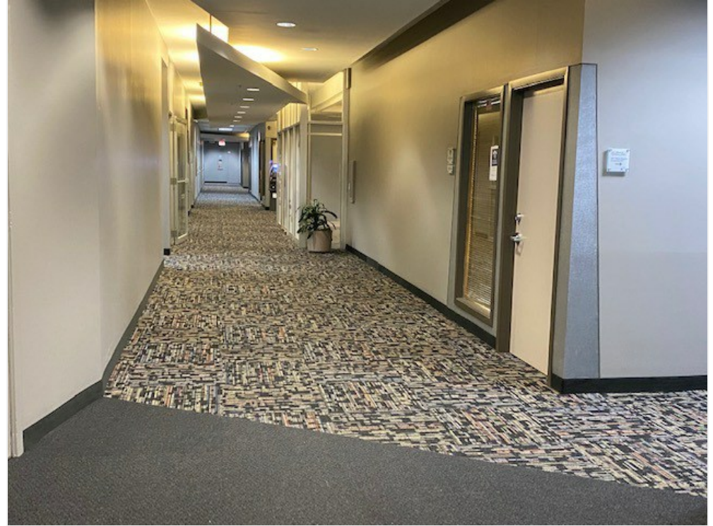
Interior Hallway 1821 University