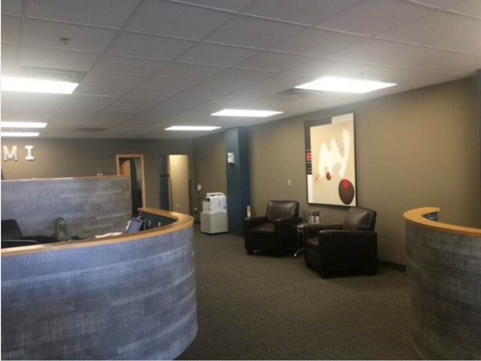
Property Management On Site