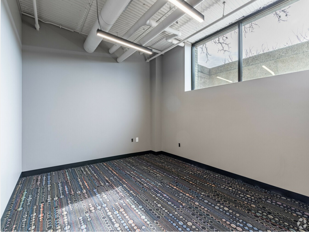
Small Business Center