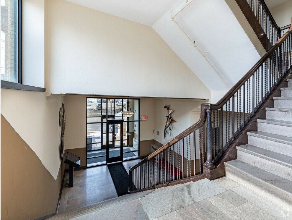
Lobby 540 Fairview