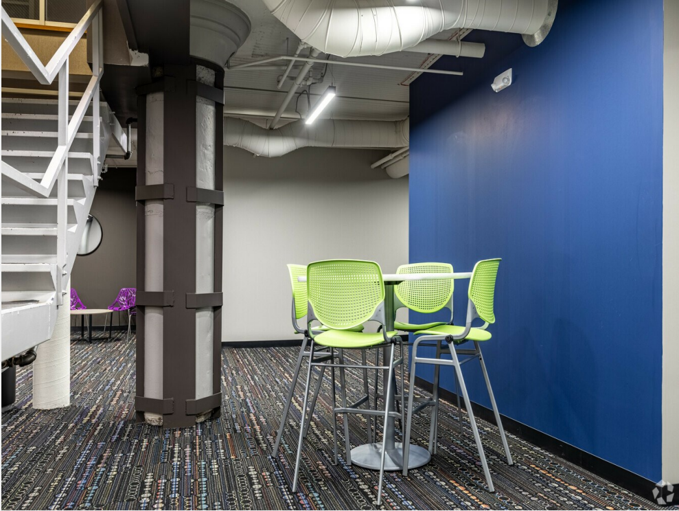
Small Business Center