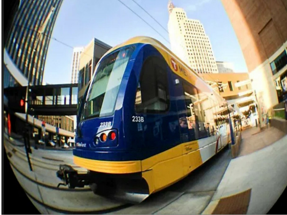
We're a light rail stop!