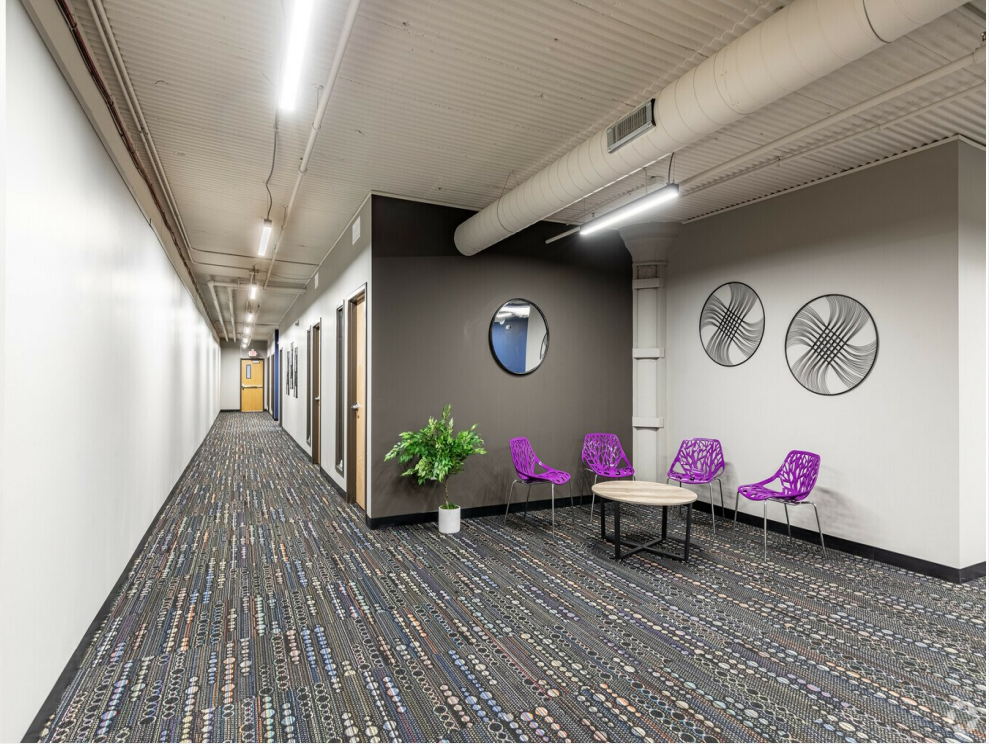
Small Business Center