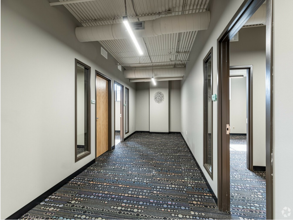
Small Business Center