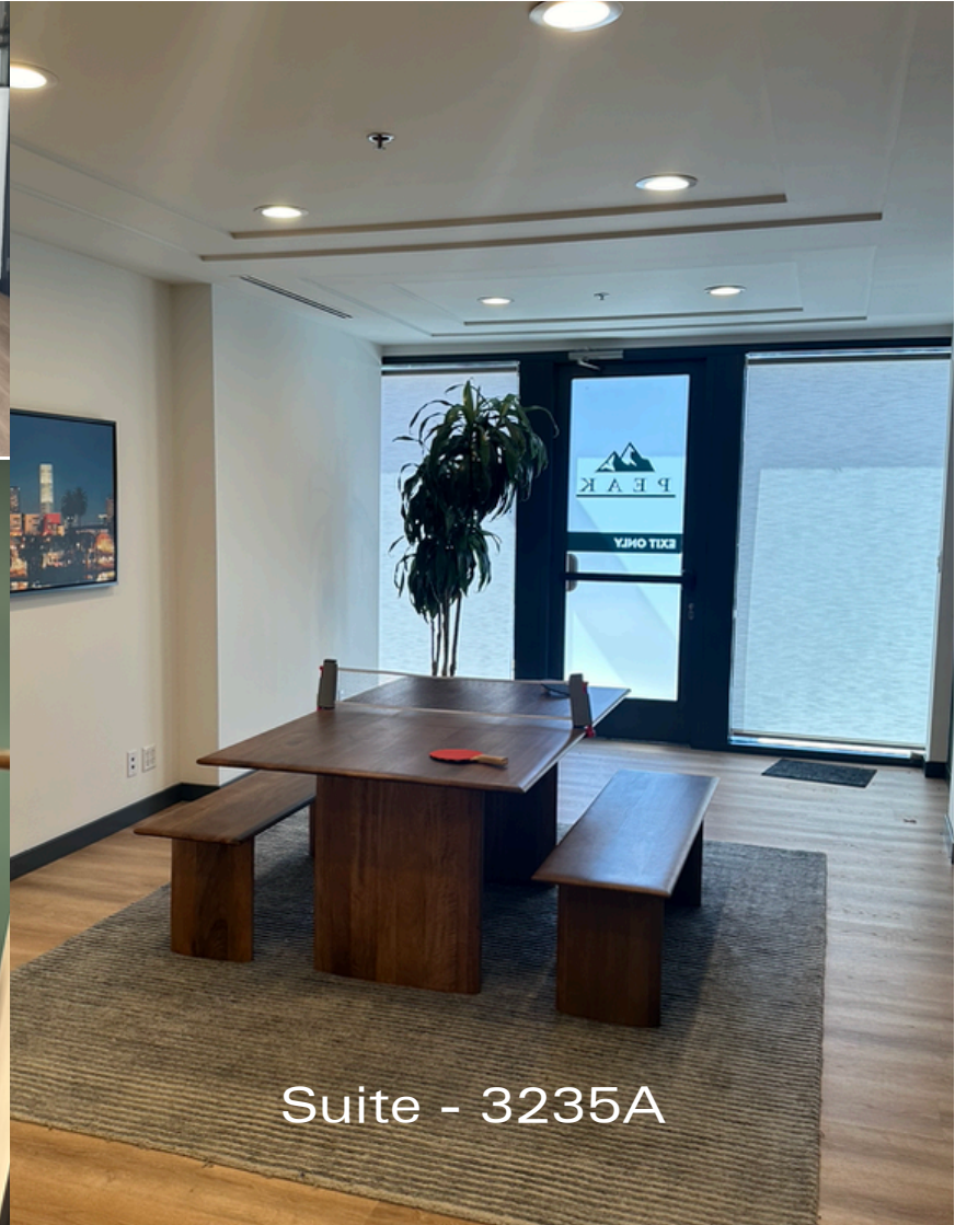
Suite - 3235A

CONTACT Craig Zund Craig@corprg.com DRE# 01897508