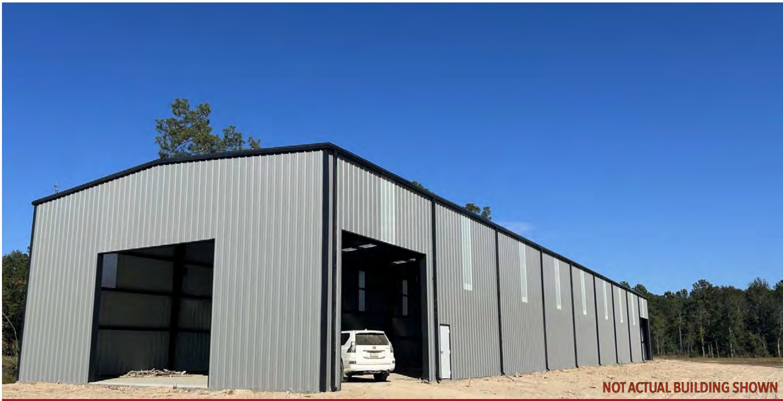
NOT ACTUAL BUILDING SHOWN