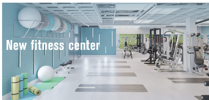
New fitness center