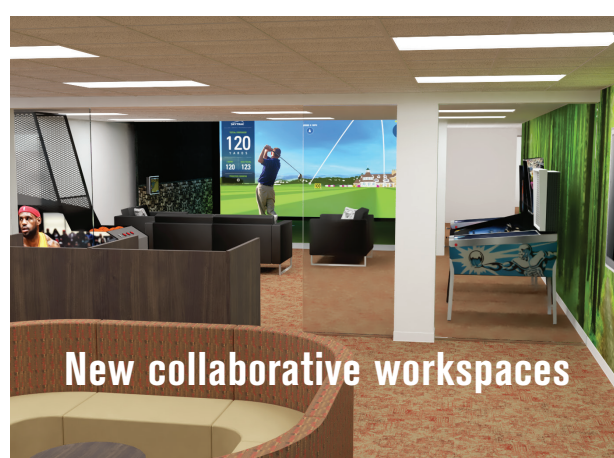
New collaborative workspaces