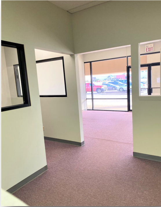
2,717 SF Office Space