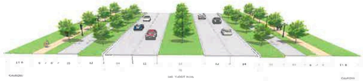
Figure 3.5: Context Zone One Proposed Street Cross Section