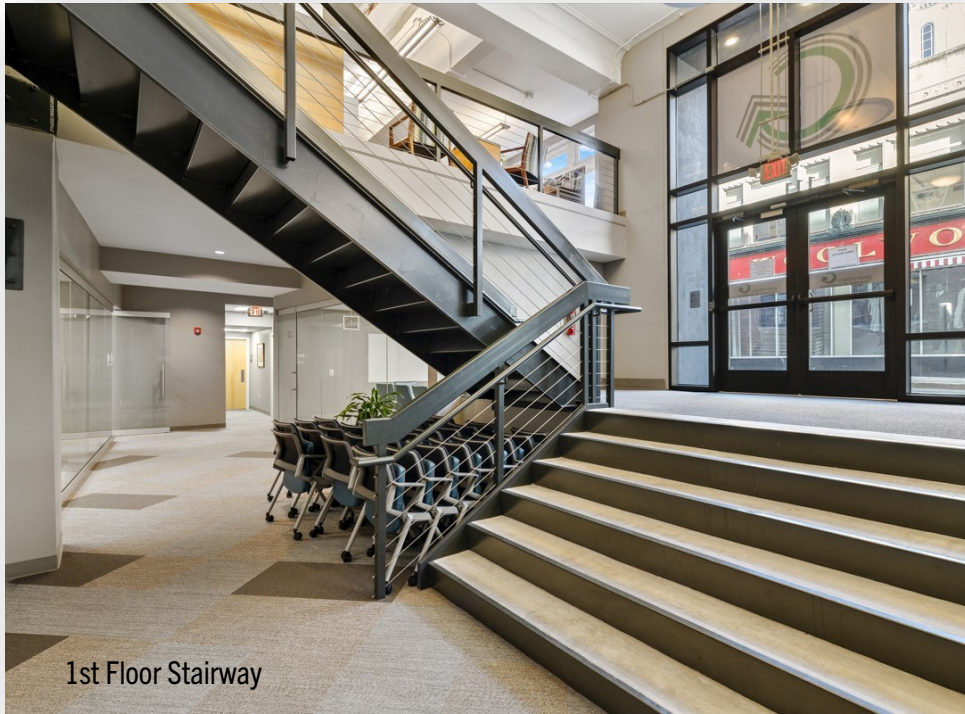
1st Floor Stairway