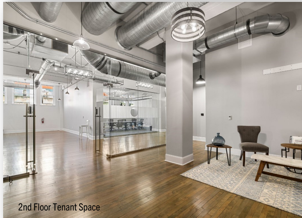
2nd Floor Tenant Space