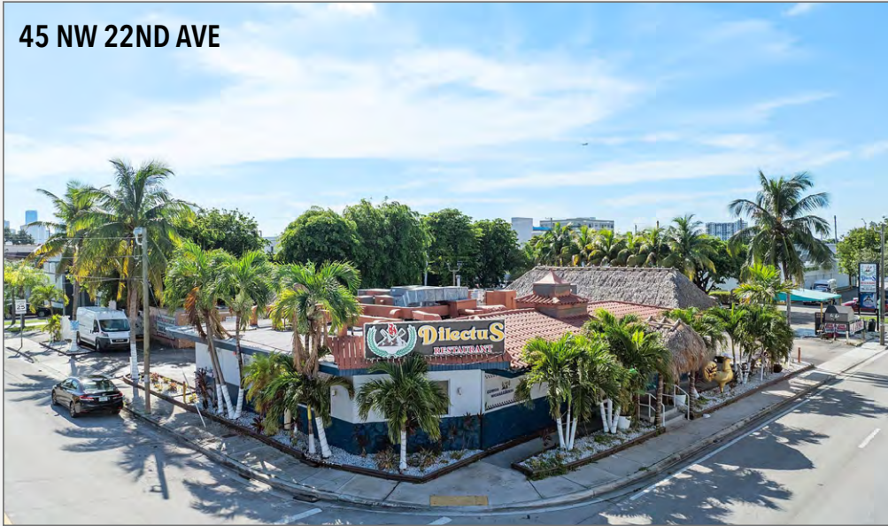
45 NW 22ND AVE