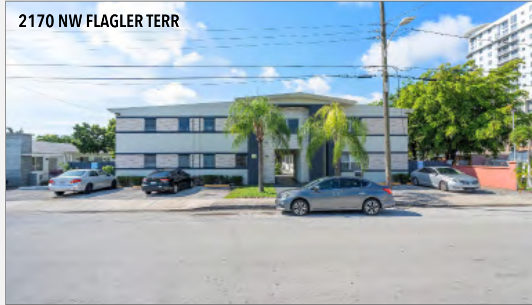
2170 NW FLAGLER TERR