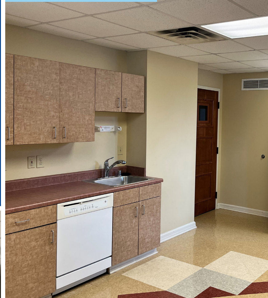
Ground Floor Break Room