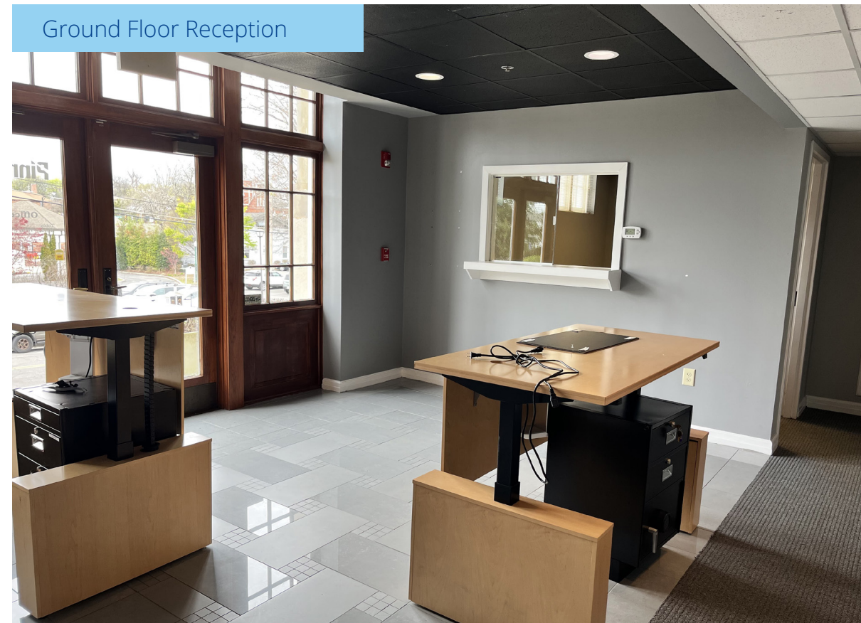
Ground Floor Reception