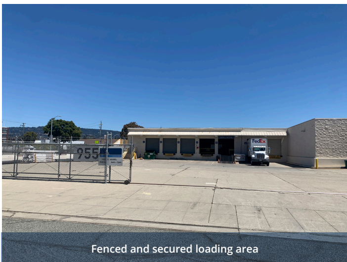
Fenced and secured loading area