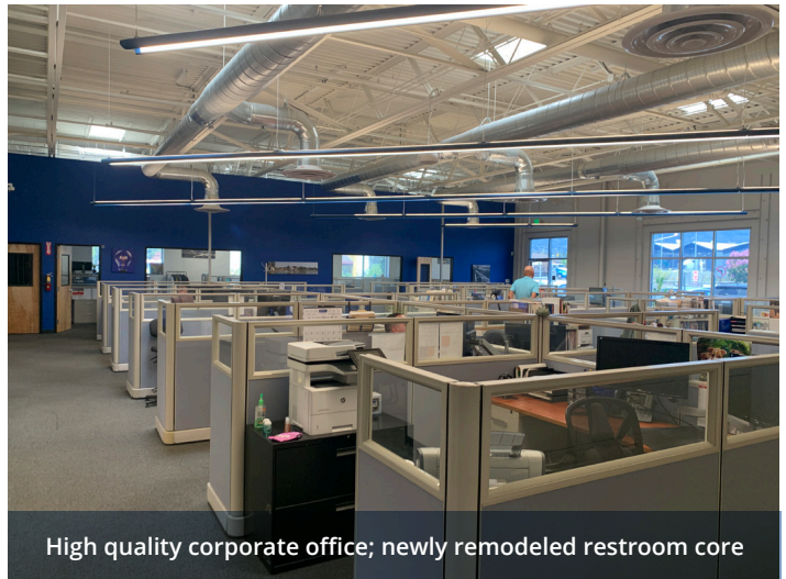
High quality corporate office; newly remodeled restroom core