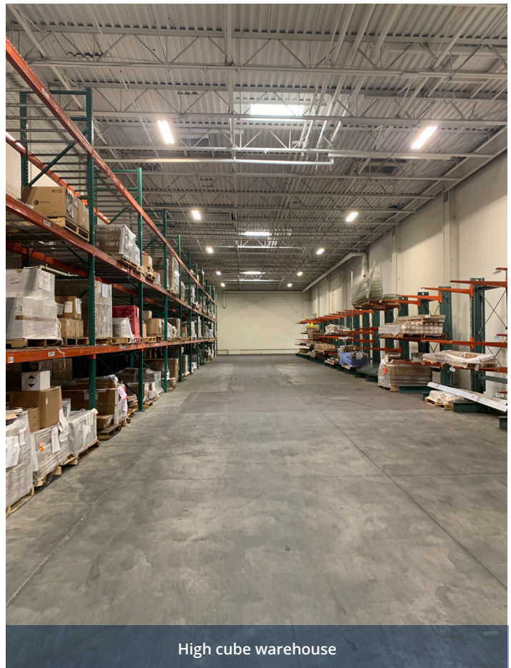
High cube warehouse