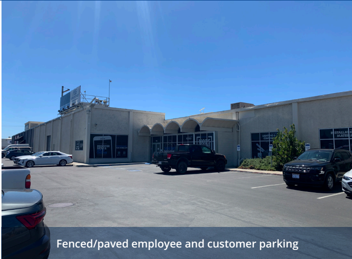
Fenced/paved employee and customer parking