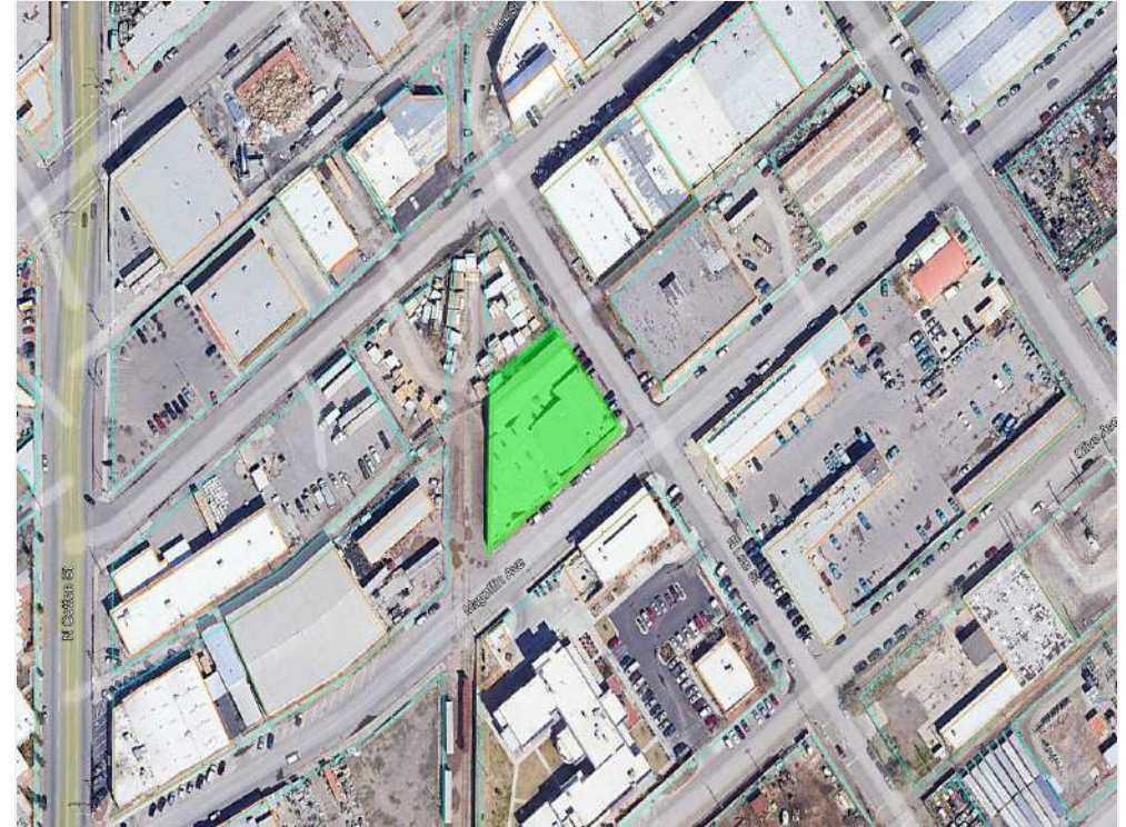
1525 magoffin 2