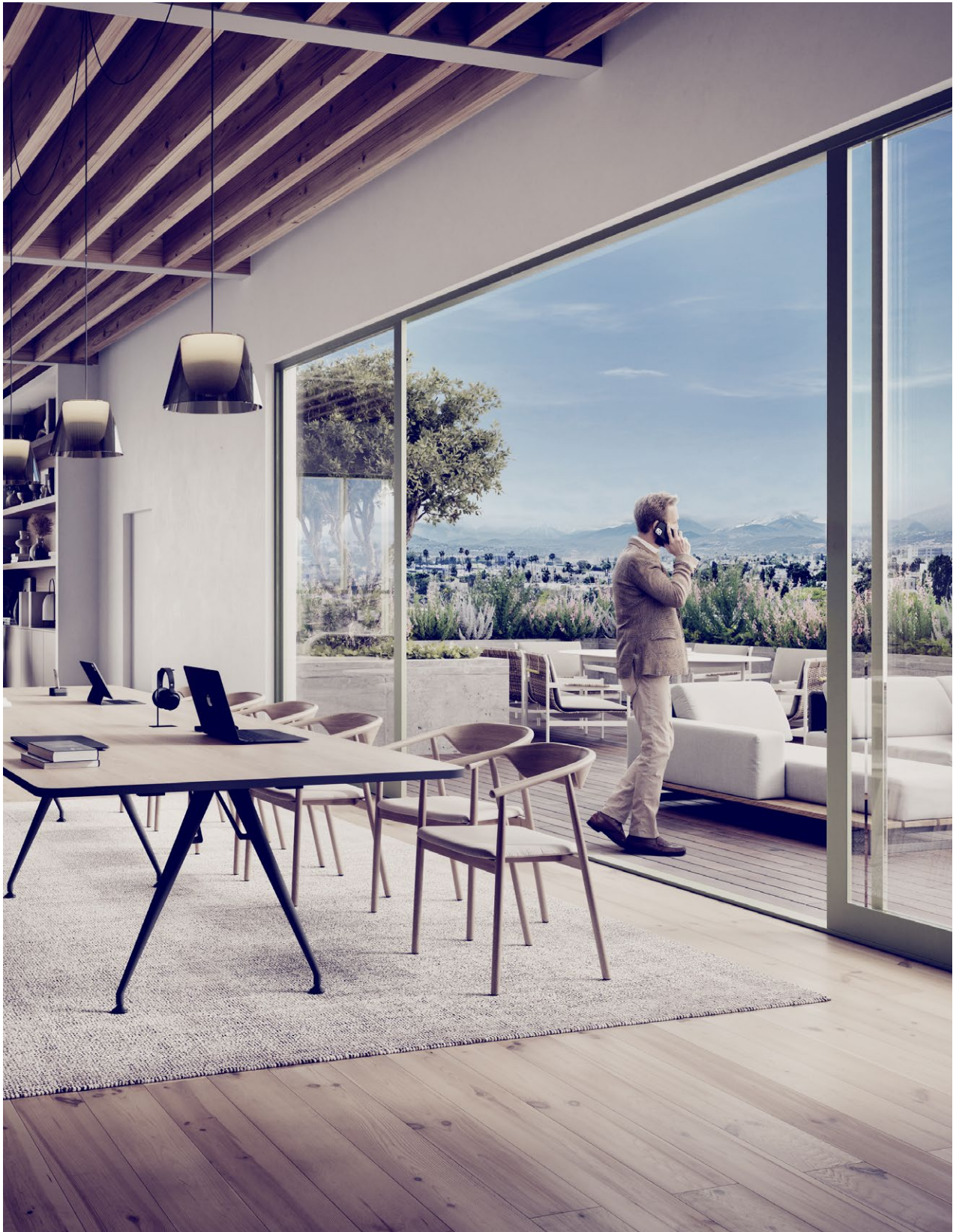
Building C Bungalow Space.