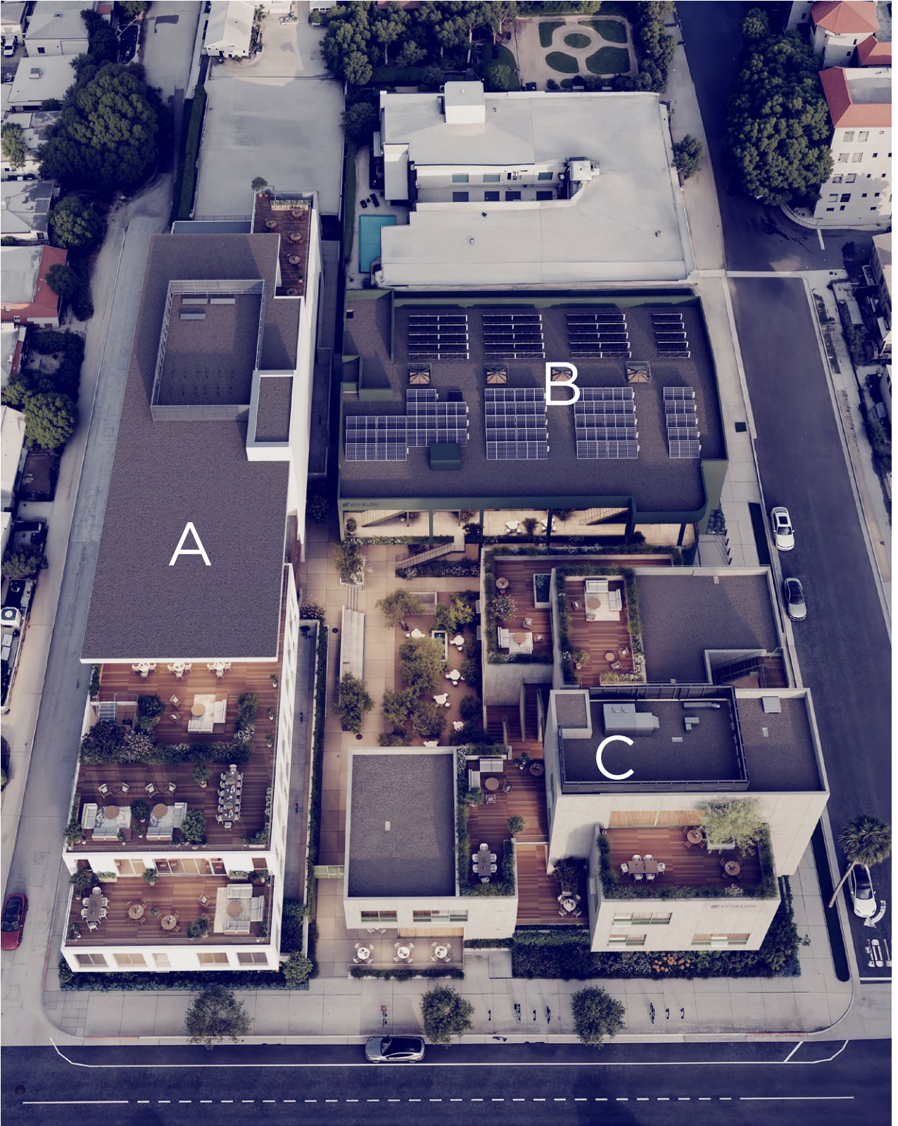
ECHELON CAHUENGA Aerial View