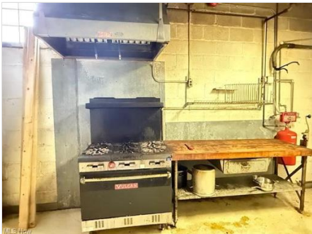
View of below grade area