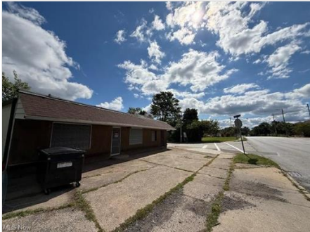
View of road featuring traffic signs