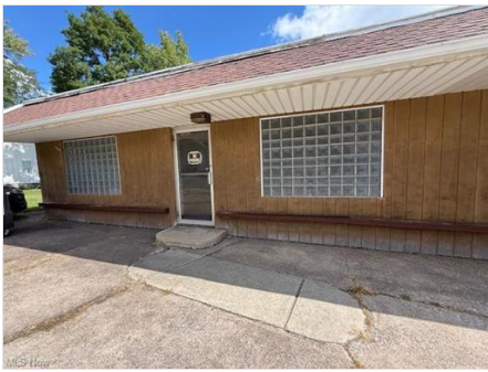
Entrance to property featuring a shingled roof