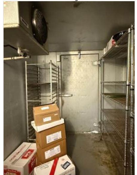
Storage area featuring a heating unit