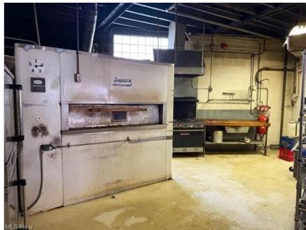
View of below grade area