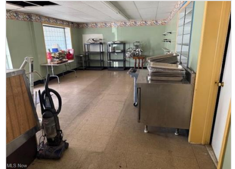
Office space with dark floors and a paneled ceiling