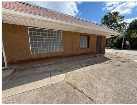
View of side of property featuring a shingled roof