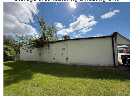
View of side of home featuring a yard and concrete block siding