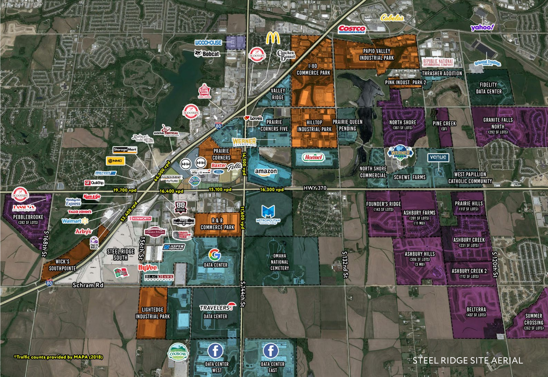
STEEL RIDGE SITE AERIAL