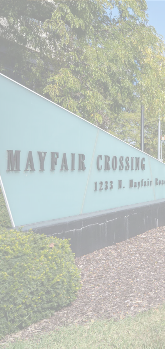
Suite 117 2,807 RSF Medical Buildout