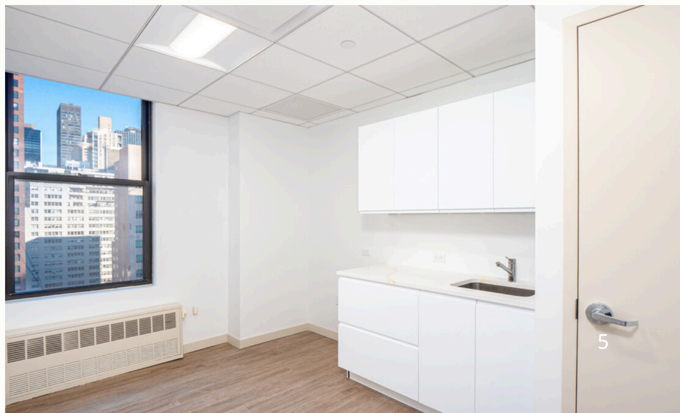
OFFICE | 11 TH FLOOR