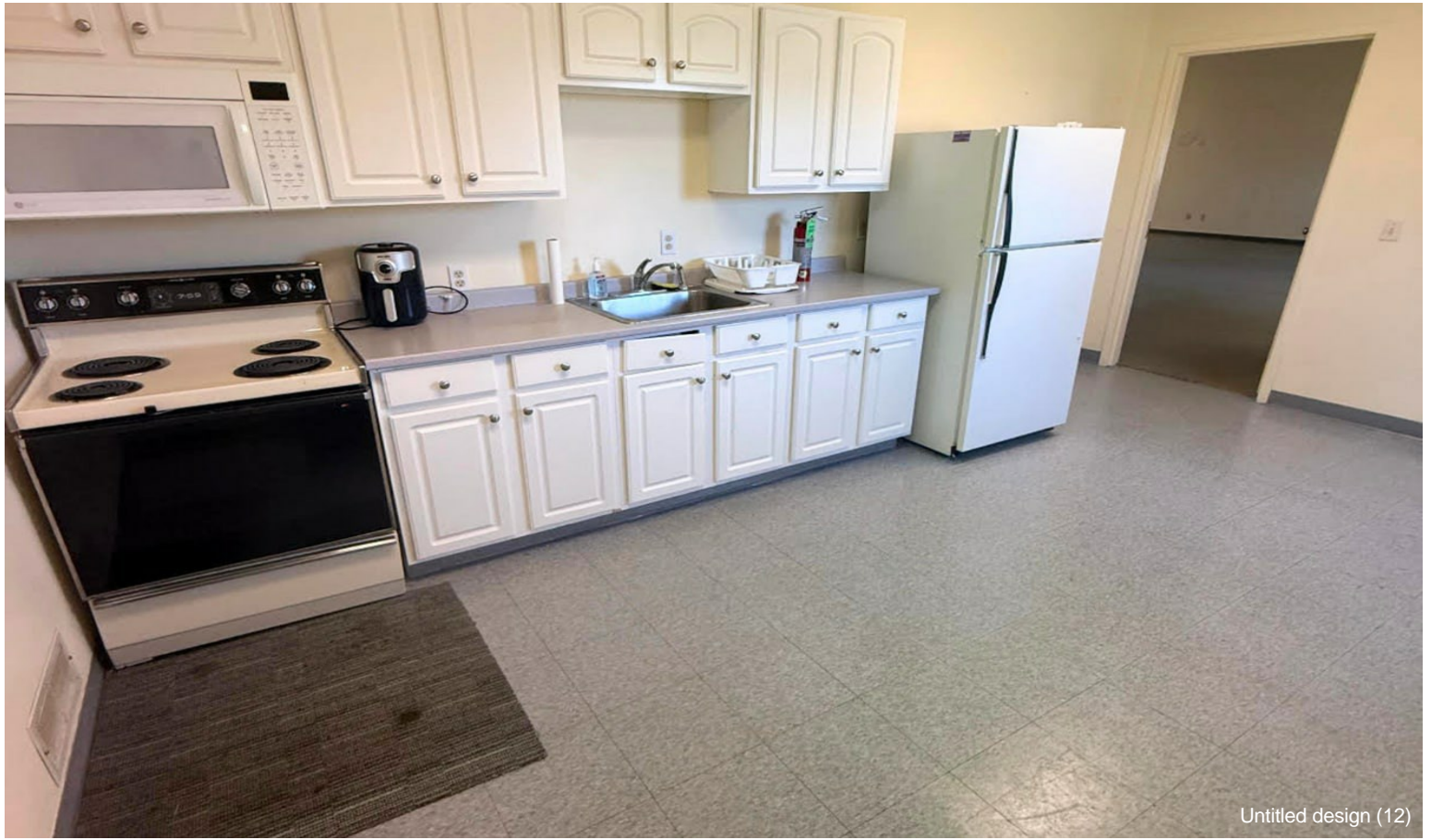
Untitled design (12)