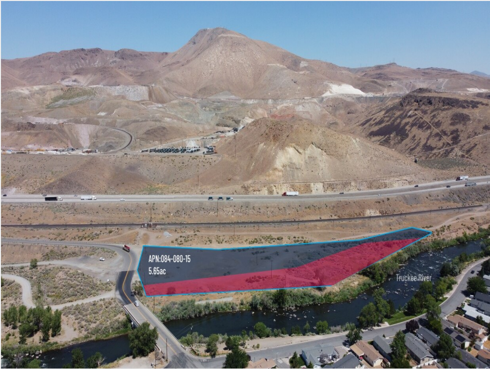
Lockwood with Flood Plain