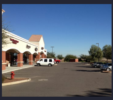
The information contained herein has been obtained from various sources. We have no reason to doubt its accuracy; however, J & J Commercial Properties, Inc. has not verified such information and makes no guarantee, warranty or representation about such information. The prospective buyer or lessee should independently verify all dimensions, specifications, floor plans, and all information prior to the lease or purchase of the property. All offerings are subject to prior sale, lease, or withdrawal from the market without prior notice.