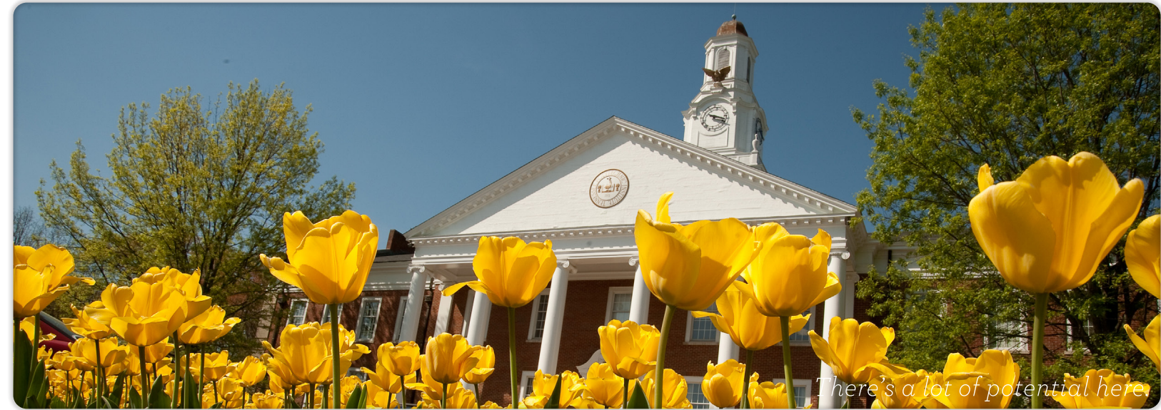
There's a lot of potential here.