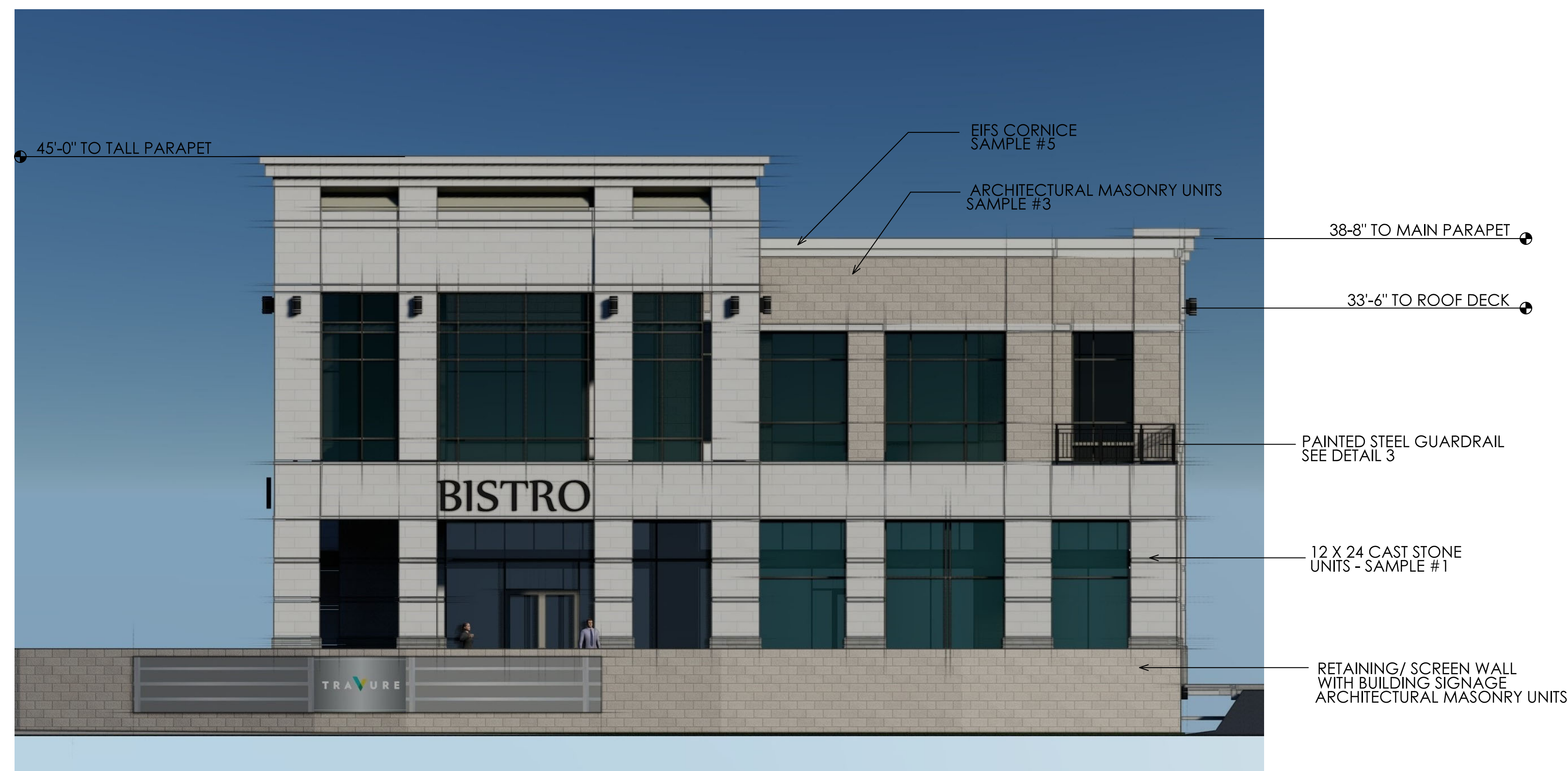
2 NORTH ELEVATION 1/8" = 1'-0"