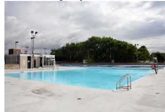
Donald D. Summerville Olympic Pool