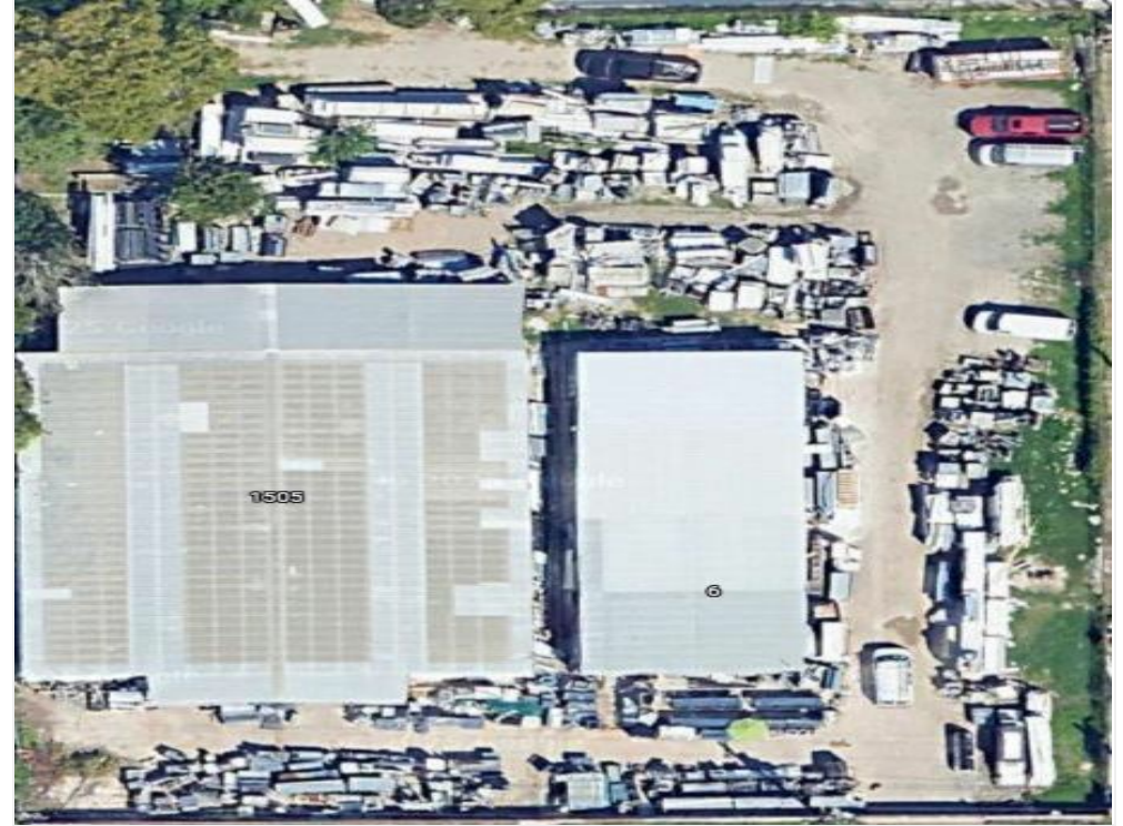
Birds Eye View