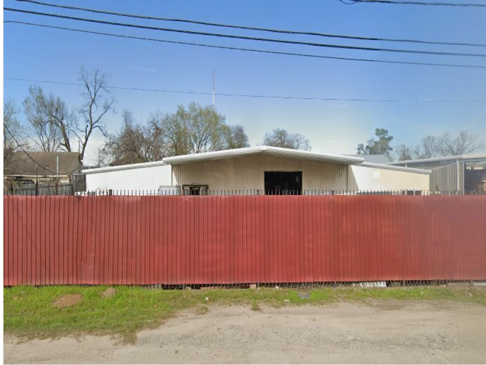
Front view of property