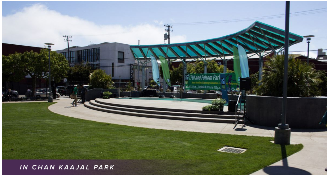
IN CHAN KAAJAL PARK