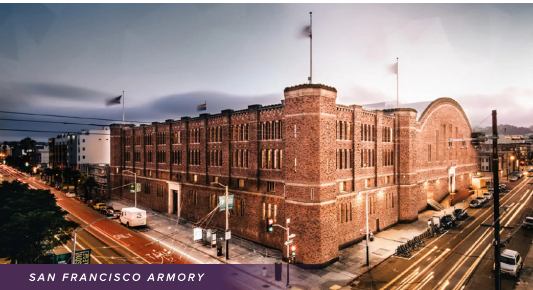
SAN FRANCISCO ARMORY