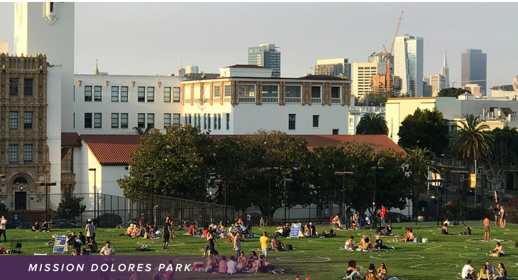
MISSION DOLORES PARK

± 11,980 SF. BLDG. ON TWO FLOORS IN THE MISSION!