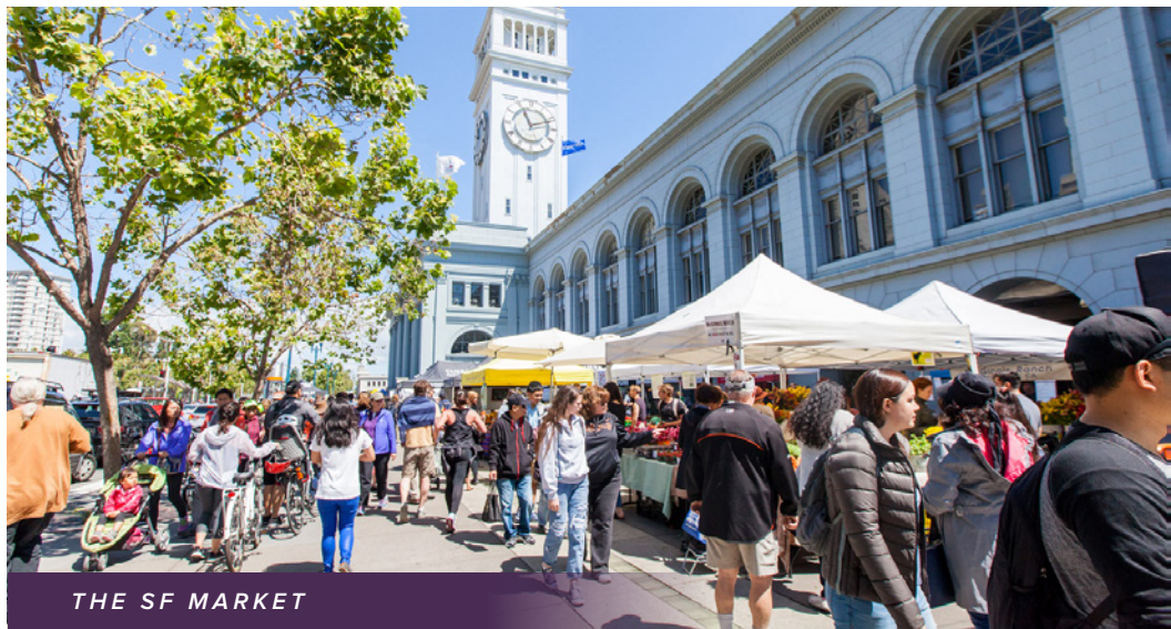
THE SF MARKET