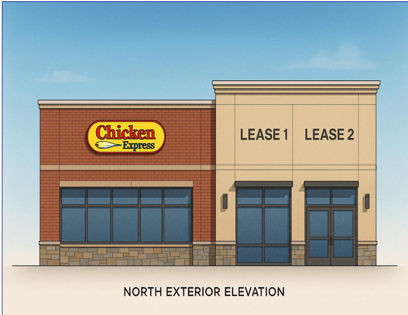
NORTH EXTERIOR ELEVATION