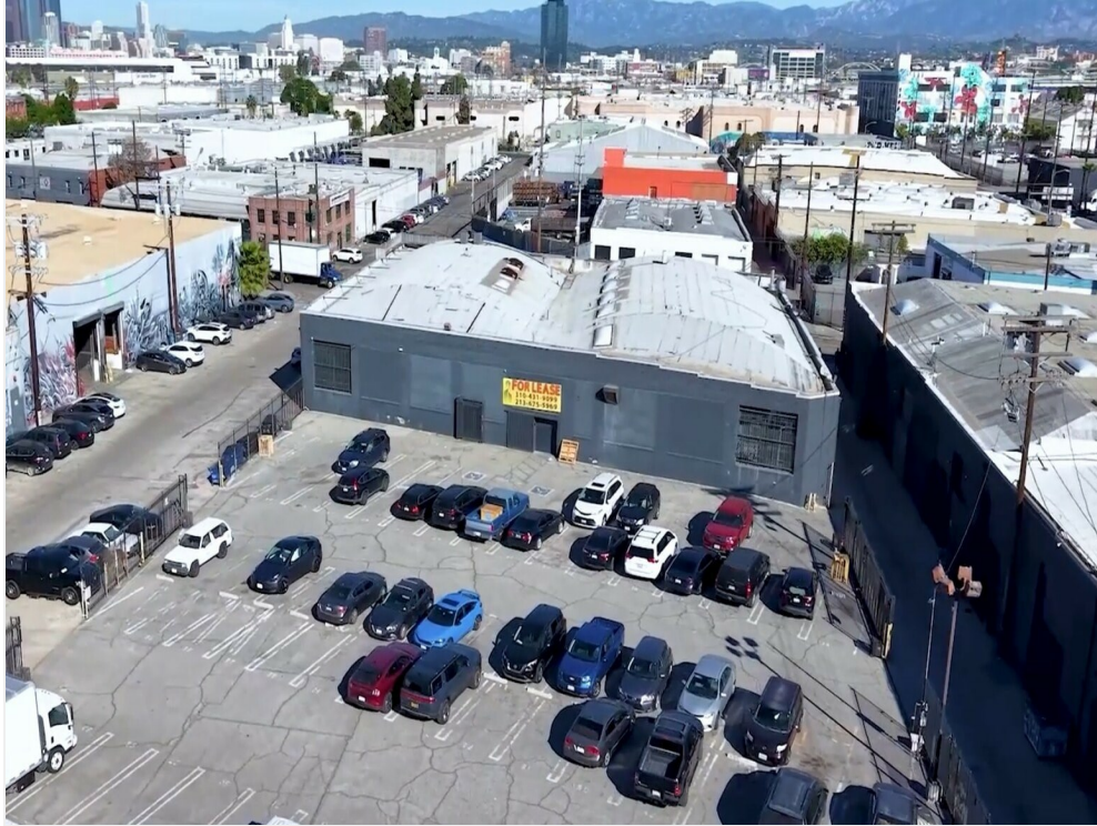
2302 E 15th St