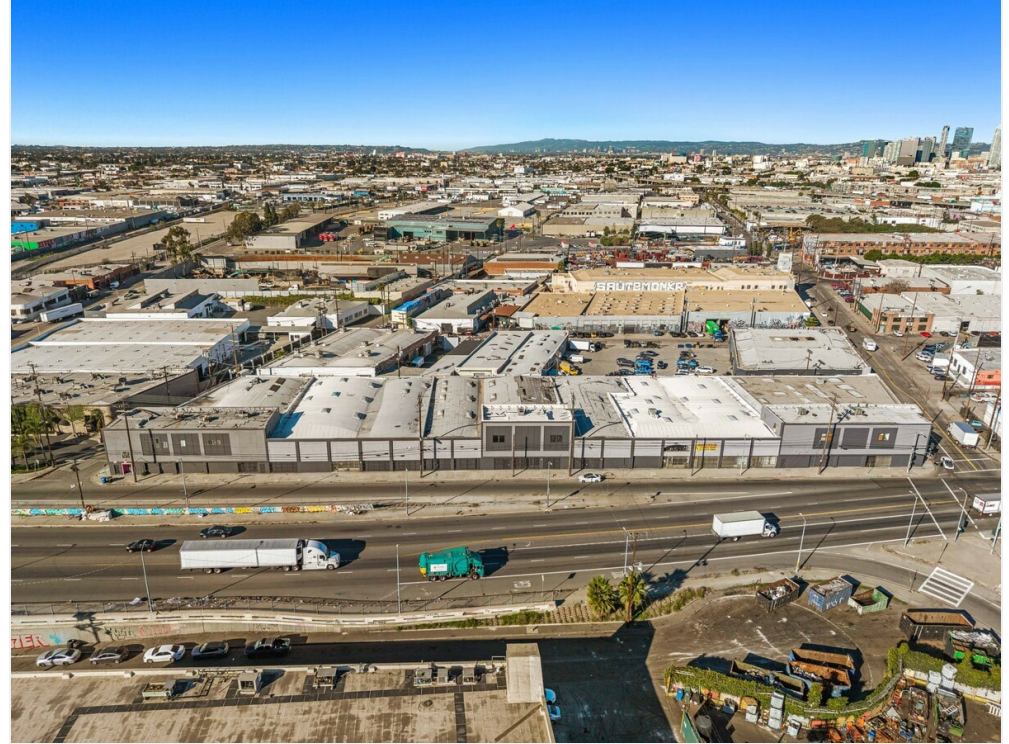
2001-2051 S SantaFeAve-2