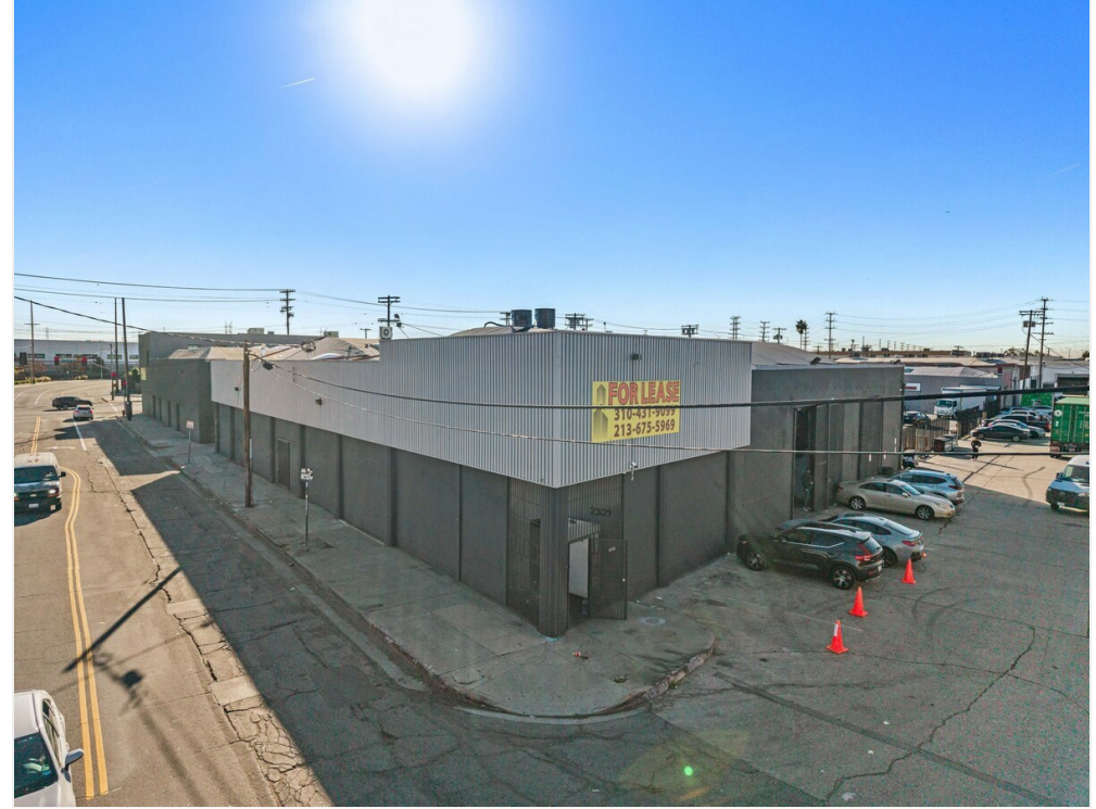
2302 E 15th St (2)