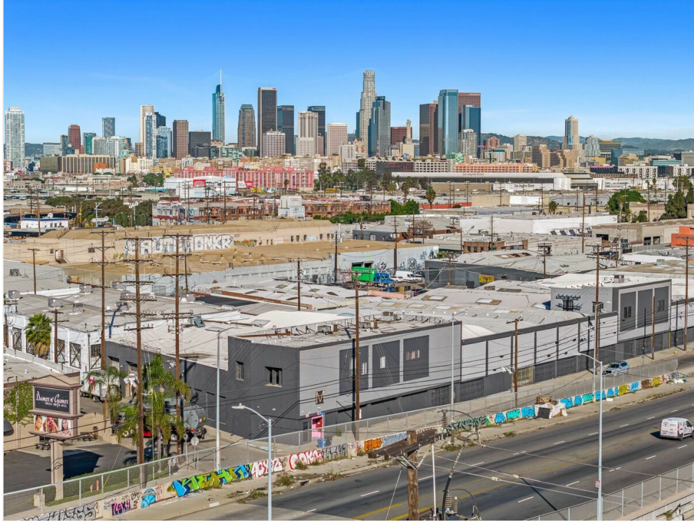
2001-2051 S SantaFeAve-3