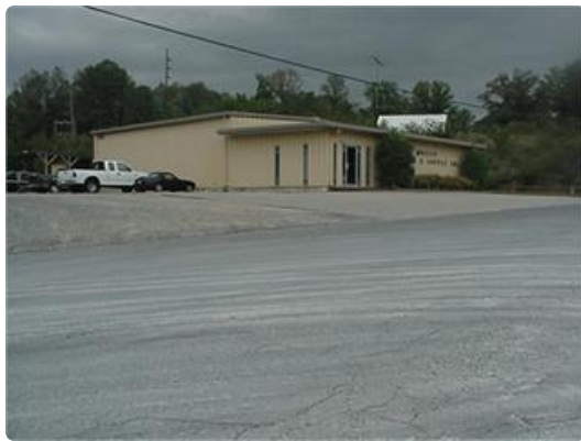
Property Photo 2