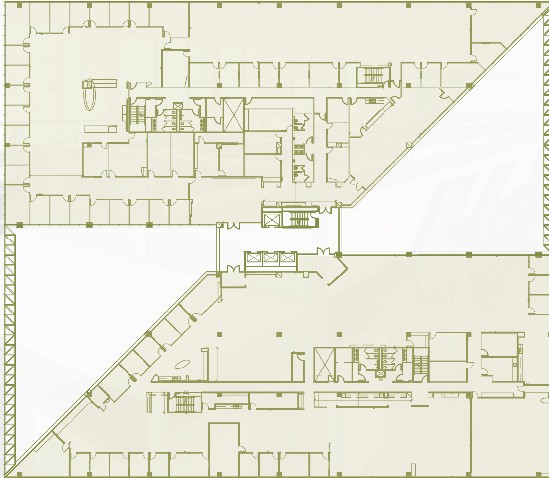
Typical Floor Plate 50K RSF ( Two 25K SF Wings)