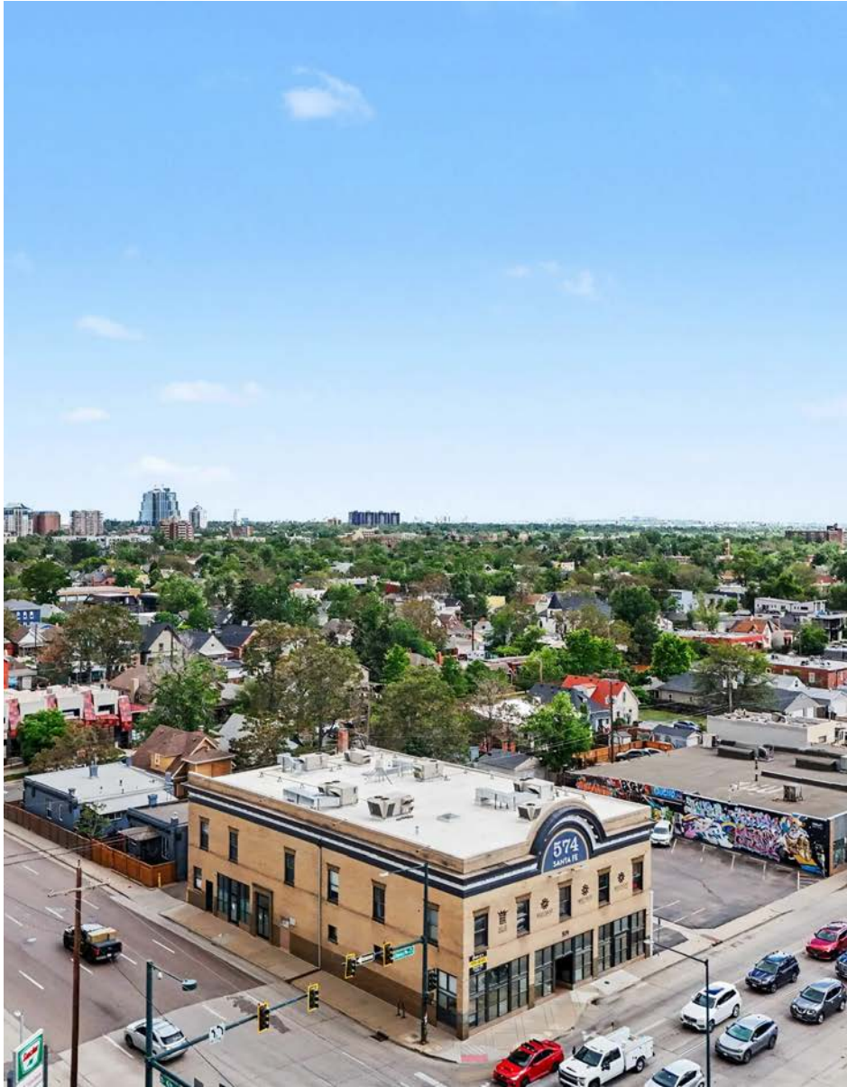
9 | 574 SANTA FE DRIVE