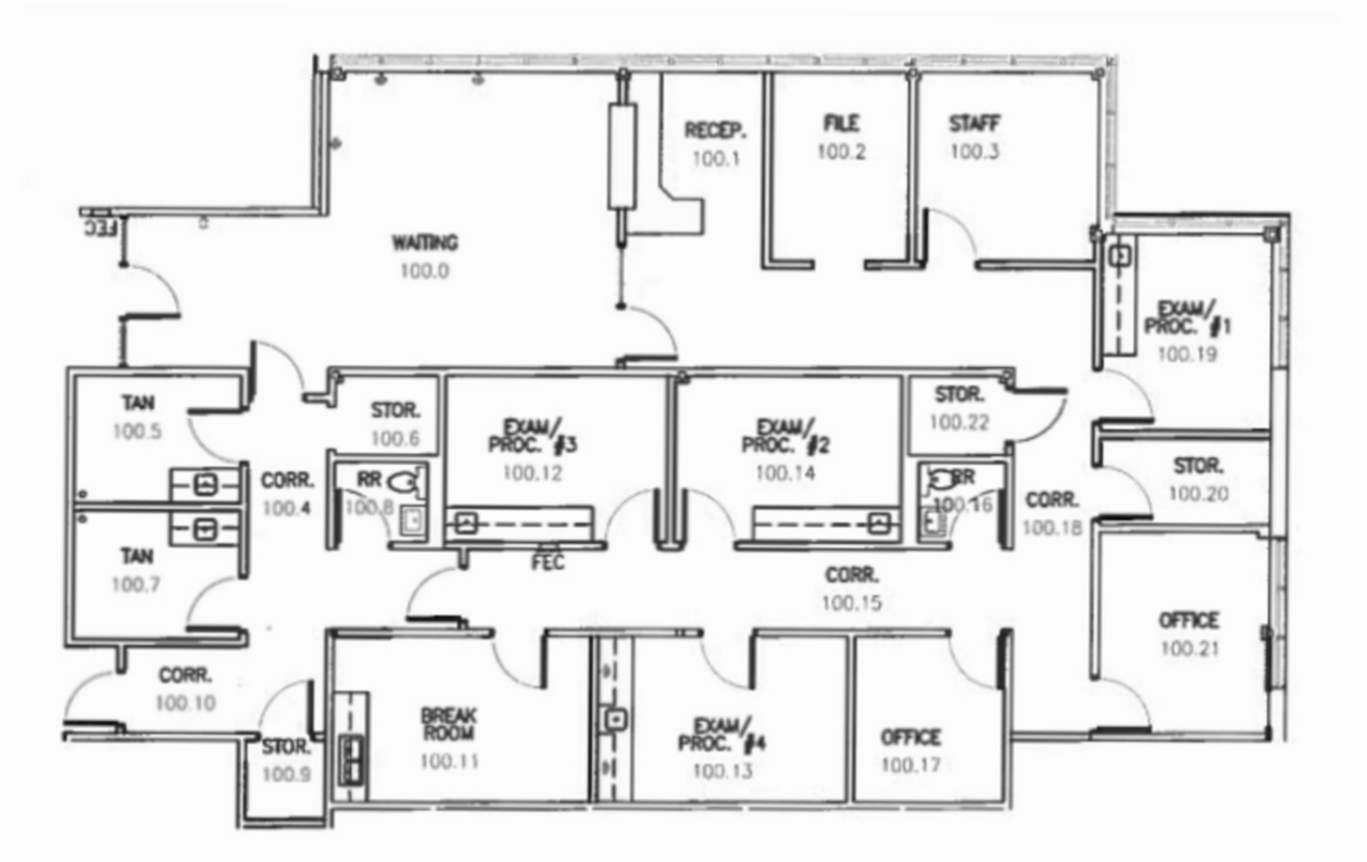
SUITE 100: 2,942 SF