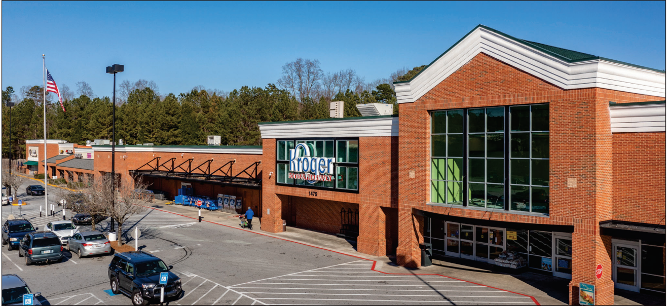
1475 Buford Drive, Lawrenceville, GA 30043

Kroger Anchored Center with Healthy Tenant Mix