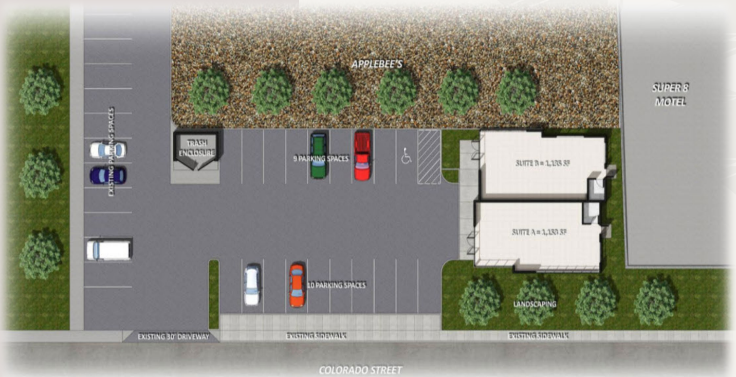
CONCEPTUAL PAD SITE PLAN