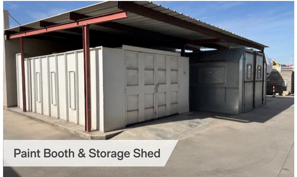
Paint Booth & Storage Shed