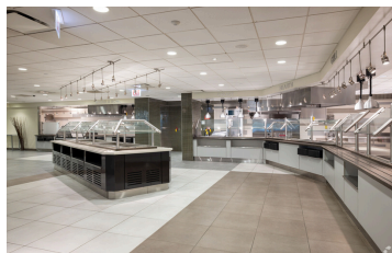
CAFETERIA & CAFE