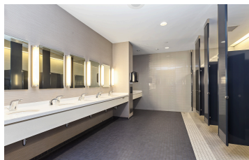
LEED GOLD (2012)