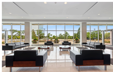
GRAND ENTRANCE LOBBY