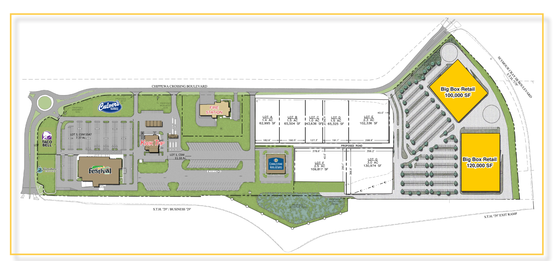
Proposed Anchor Retail Development