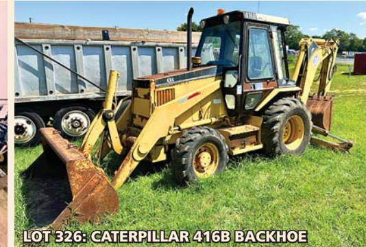
LOT 326: CATERPILLAR 416B BACKHOE

Contact Reaves Ward (540) 597-4607 or Jim Woltz (540) 353-4582 woltz.com • (540) 342-3560 or (800) 551-3588