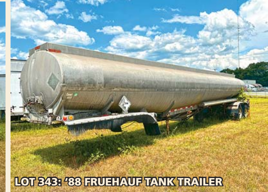
LOT 343: '88 FRUEHAUF TANK TRAILER