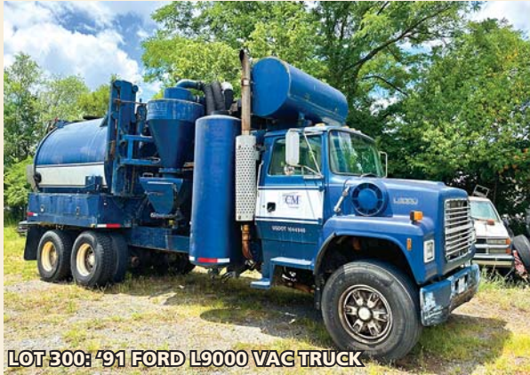
LOT 300: '91 FORD L9000 VAC TRUCK