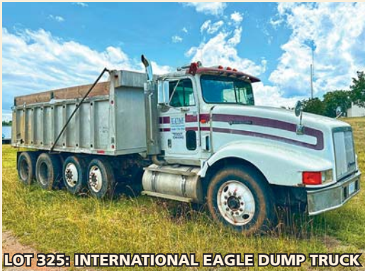
LOT 325: INTERNATIONAL EAGLE DUMP TRUCK