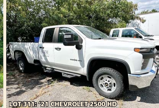
LOT 311: '21 CHEVROLET 2500 HD