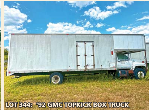
LOT 344: '92 GMC TOPKICK BOX TRUCK