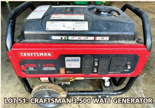
LOT 51: CRAFTSMAN 3,500 WATT GENERATOR