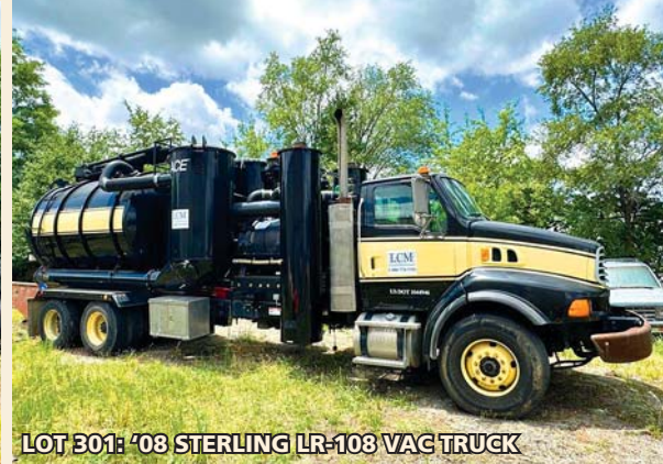
LOT 301: '08 STERLING LR-108 VAC TRUCK