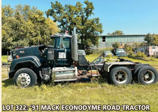
LOT 322: '91 MACK ECONODYME ROAD TRACTOR