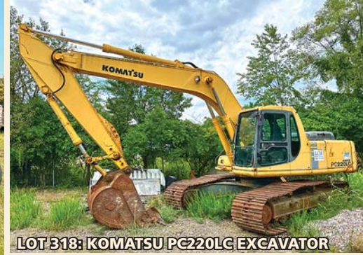
LOT 318: KOMATSU PC220LC EXCAVATOR