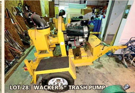
LOT 28: WACKER 6" TRASH PUMP