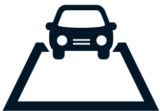
Gated Parking Garage