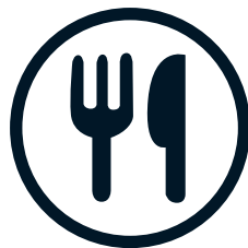
Walking Distance to Nearby Amenities