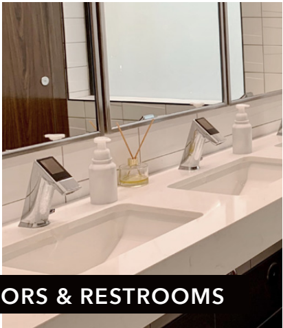
RECENTLY REMODELED COMMON CORRIDORS & RESTROOMS