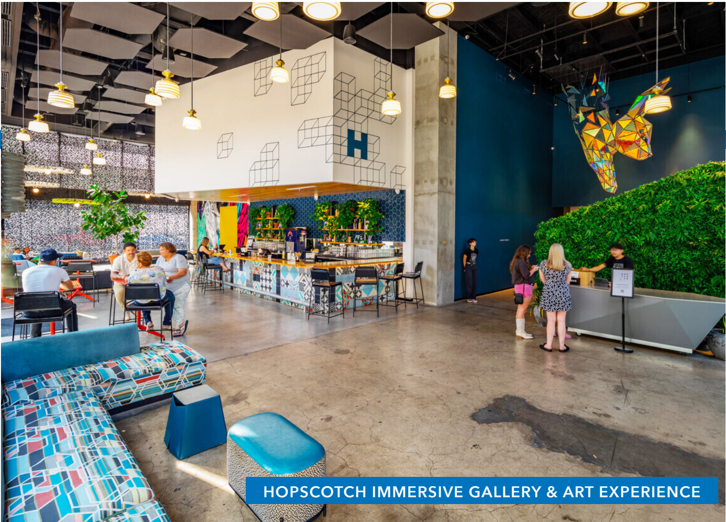
HOPSCOTCH IMMERSIVE GALLERY & ART EXPERIENCE