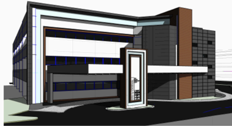
2 3D VIEW - COVERED DROP-OFF