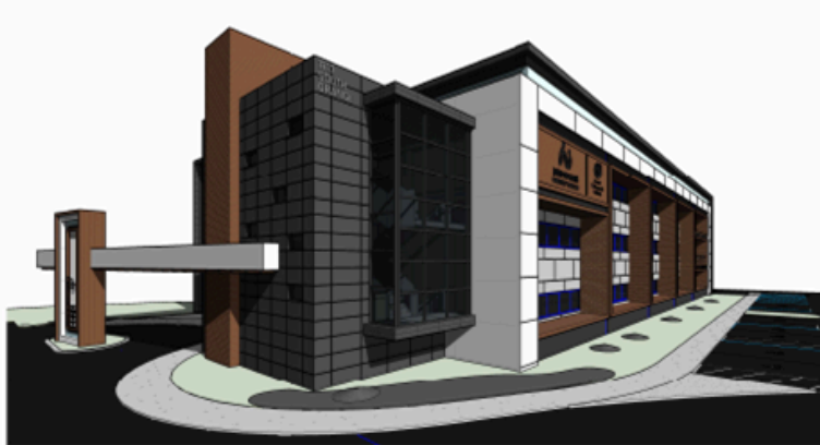
1 3D VIEW - ATRIUM