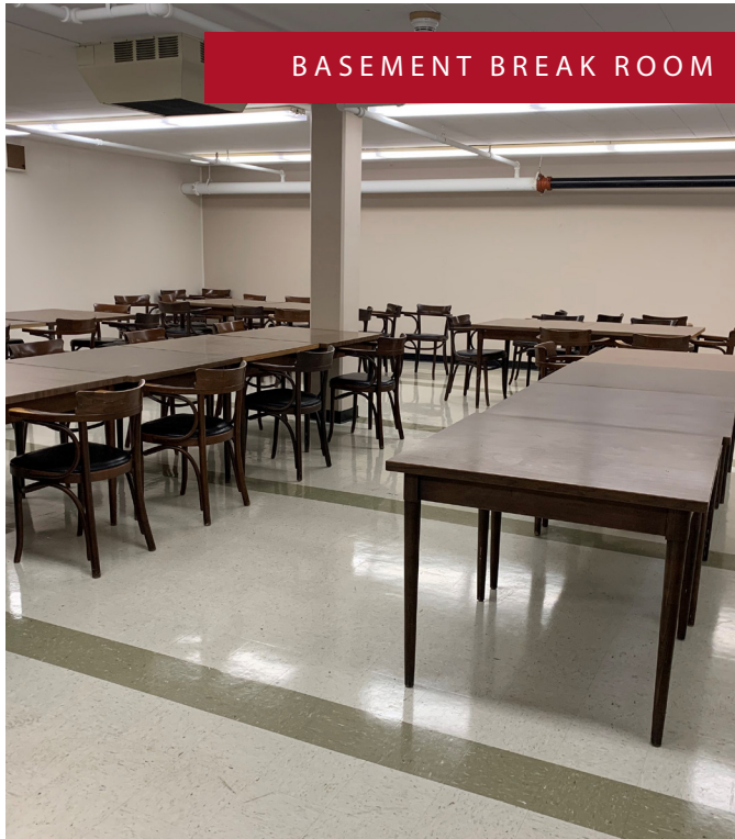
BASEMENT BREAK ROOM