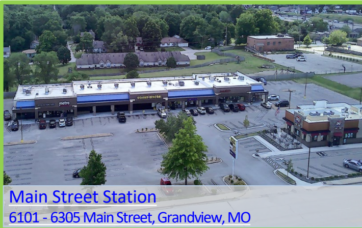
Main Street Station 6101 - 6305 Main Street, Grandview, MO