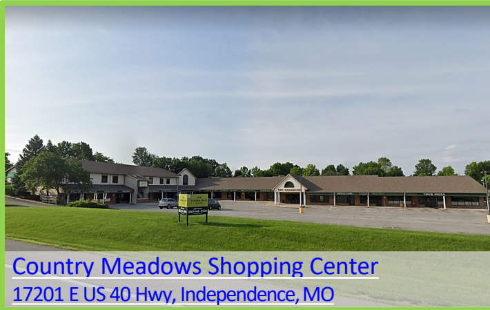
Country Meadows Shopping Center 17201 E US 40 Hwy, Independence, MO