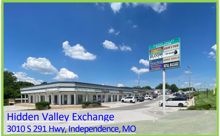
Hidden Valley Exchange 3010 S 291 Hwy, Independence, MO