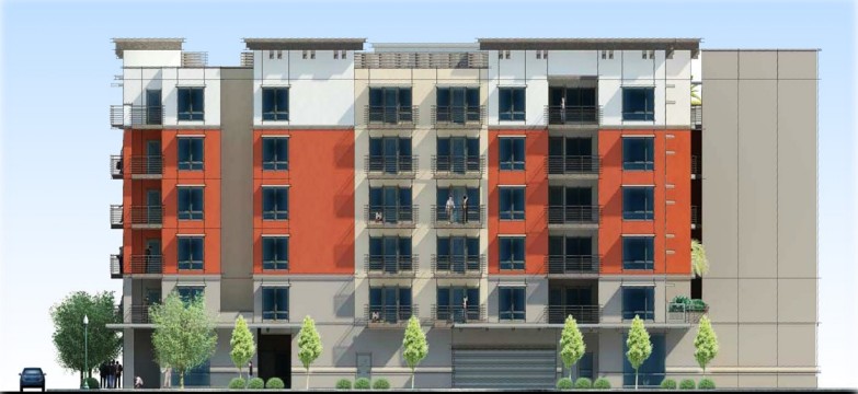
BUILDING B — WEST ELEVATION