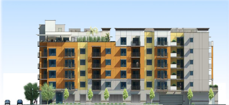
BUILDING A — WEST ELEVATION