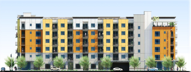
BUILDING A — NORTH ELEVATION