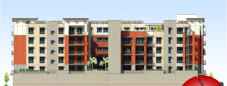
BUILDING B — SOUTH ELEVATION