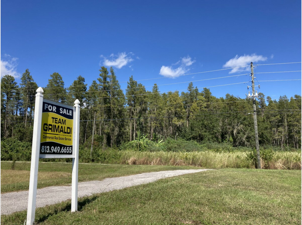
20233 SR54 LUTZ pic2