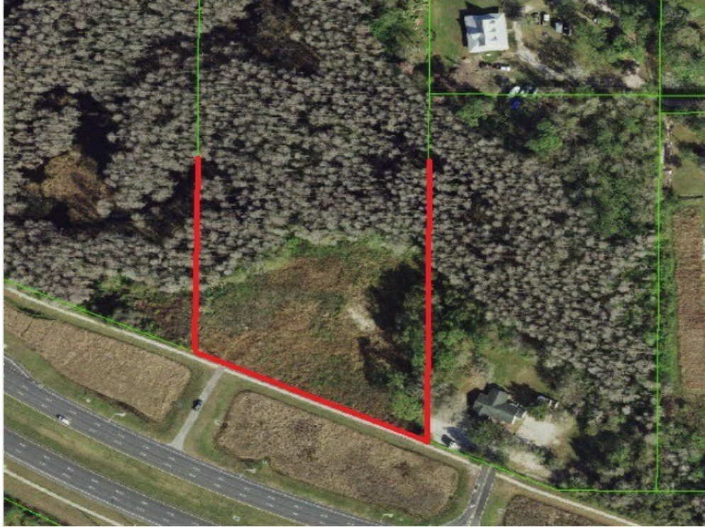
STATE ROAD 54 RETAIL DEVELOPMENT SITE PIC 2