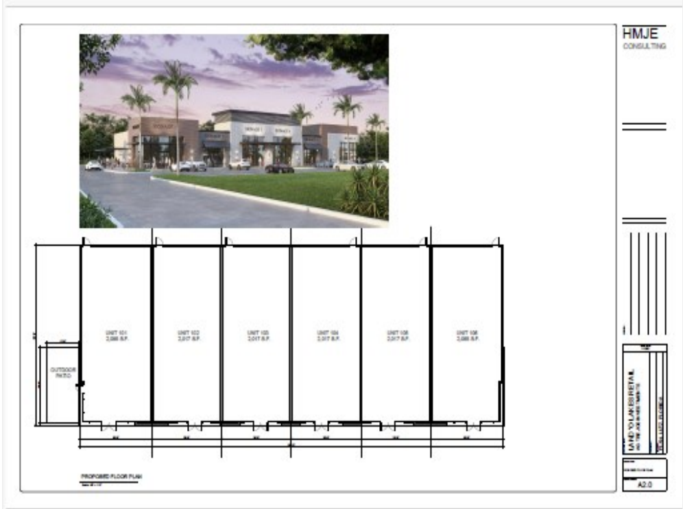
SR54 RETAIL CENTER CONCEPT PLAN