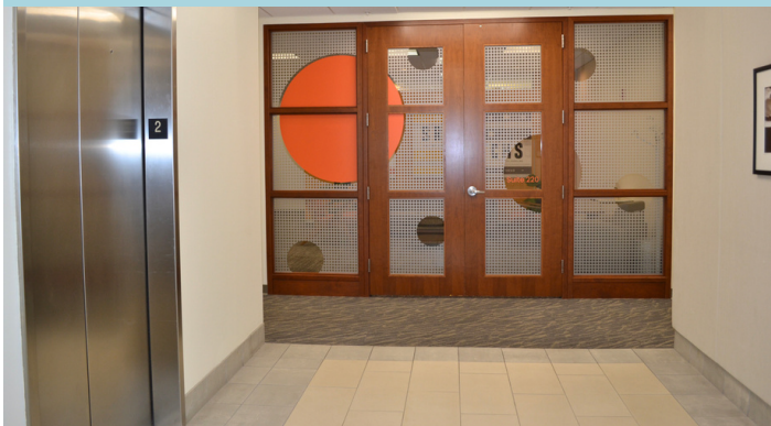
Direct lobby access