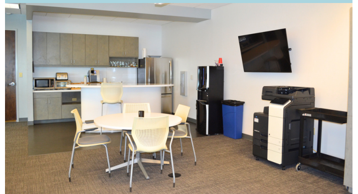
Break area with seating