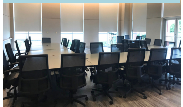
On-site conference center