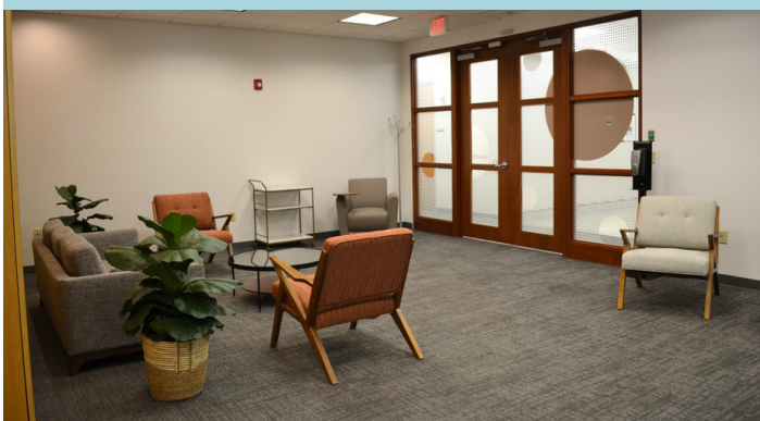
Welcoming reception area