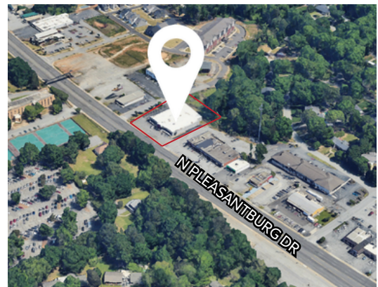
GREENVILLE COUNTY TAX MAP NO 0276000300508 and GREENVILLE COUNTY TAX MAP NO 0276000300504