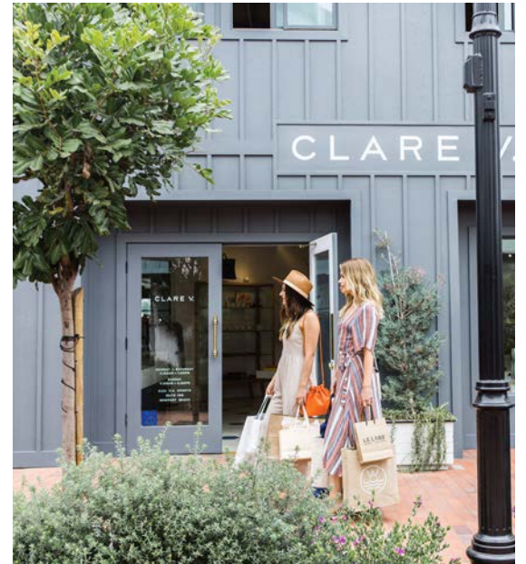
LIDO MARINA VILLAGE