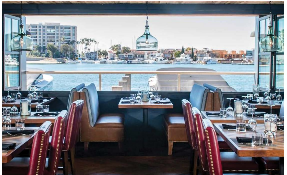
LOUIE'S BY THE BAY