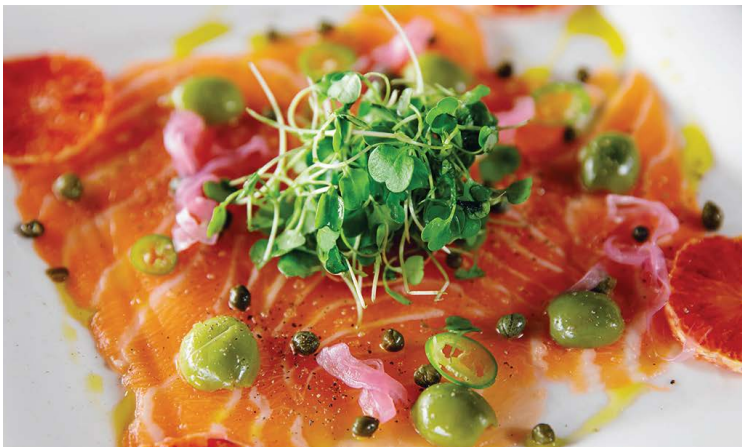
TAVERN HOUSE KITCHEN + BAR