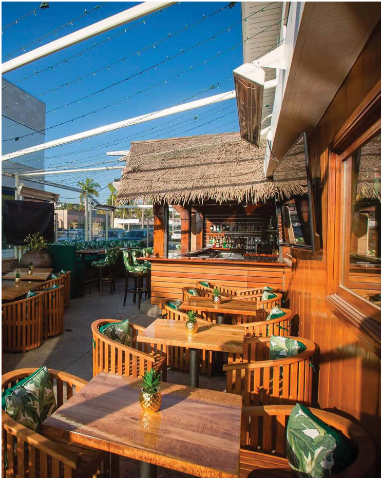
BILLY'S AT THE BEACH