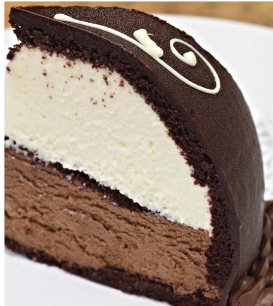
C'EST SI BON BAKERY